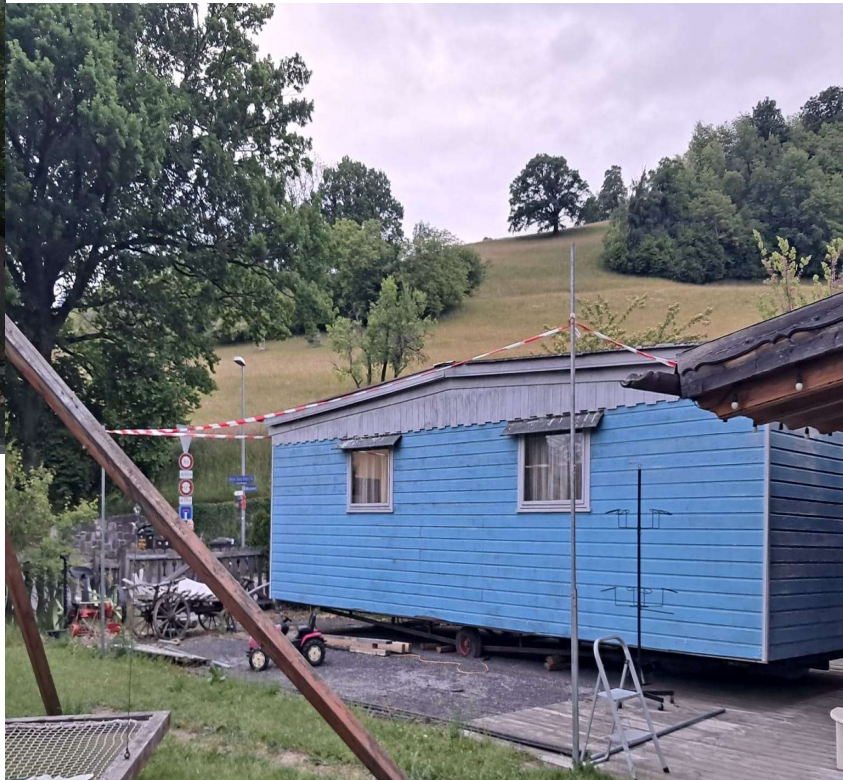
Visire: Umkleide, Wohnwagen 4