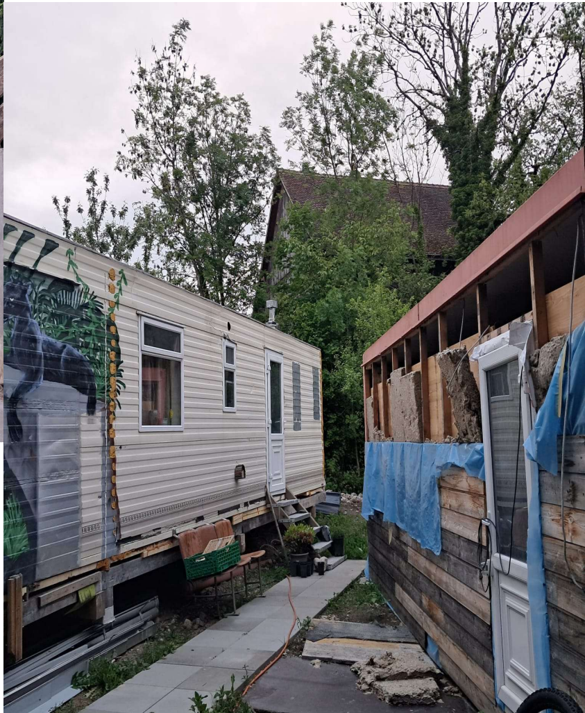
Visire: Kiosk Bestand: TinyHaus, Baracke 1