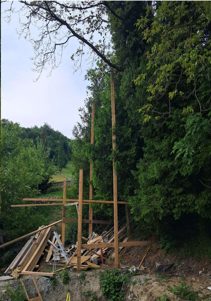
Visire: Stall, Sauna, Baumhaus, Baracke 2, Bestand: Baracke 3+4