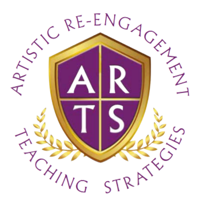
Creating: Self-Worth, Opportunities & Compassion