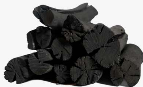
Mangrove Kachie Charcoal