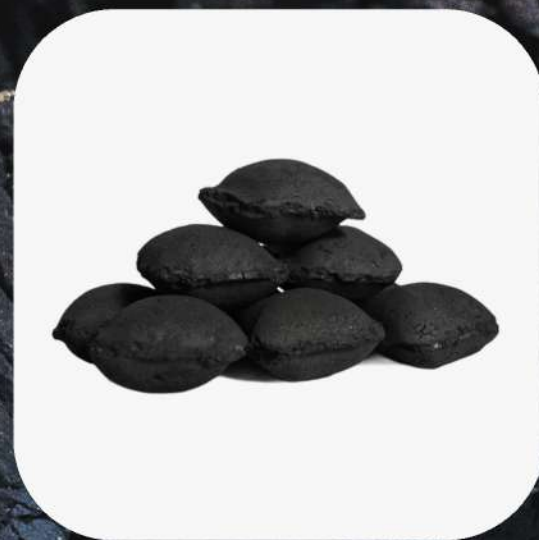
Pillow (in mm)