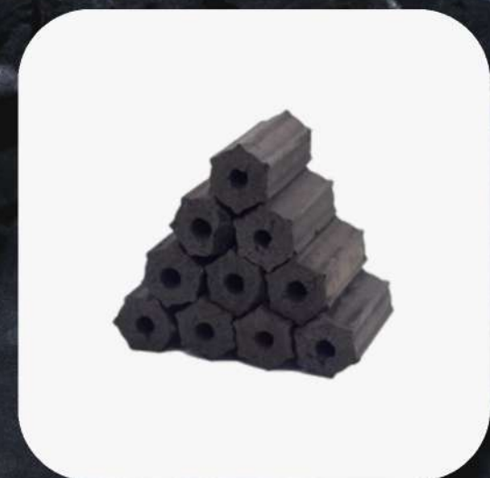
Hexa (in mm)