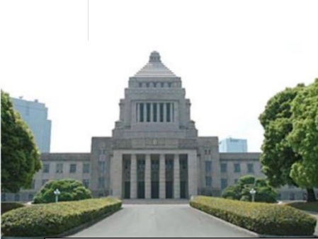
National Diet Building

Penetrating reactive anti-degradation water repellent for various materials such as concrete, bricks, wood, and stone.