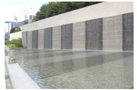
Prime Minister's Official Residence