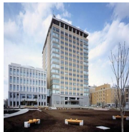
Office & Assembly Hall