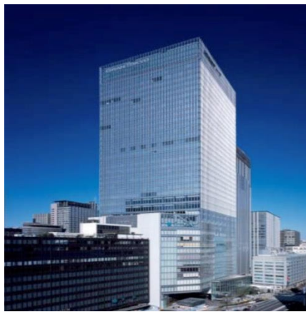
Tochigi Prefectural Government