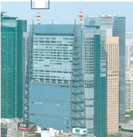
Nippon Television Network Corporation