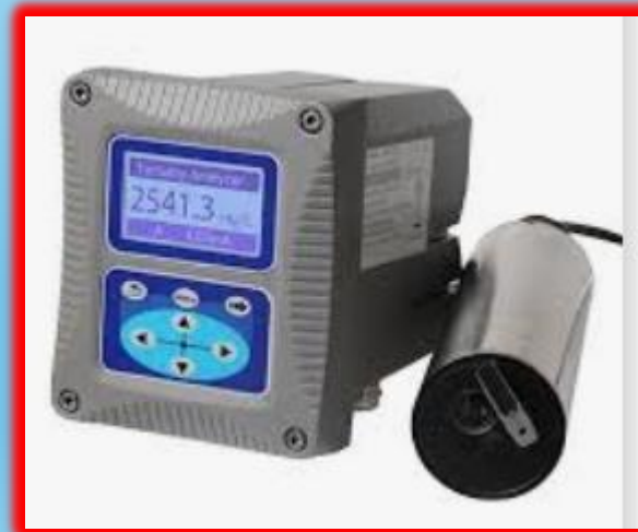
Online Turbidity Meter