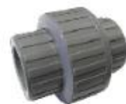
WATER MOOR (PVC)