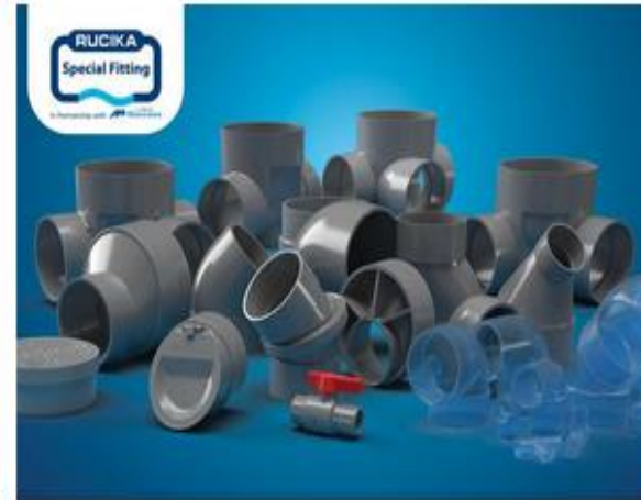
Rucika Hygienic System Special Fitting