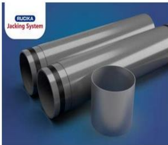
Rucika Jacking System