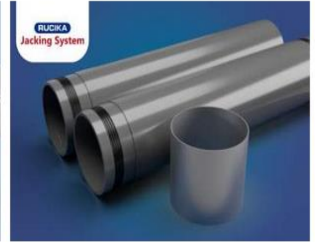
Rucika Jacking System