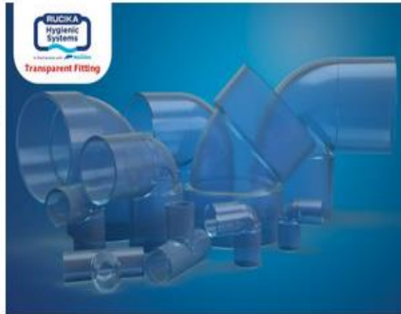
Rucika Hygienic System Transparent Fitting