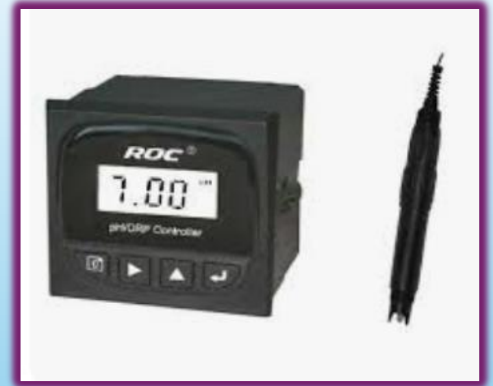
Online pH Meter