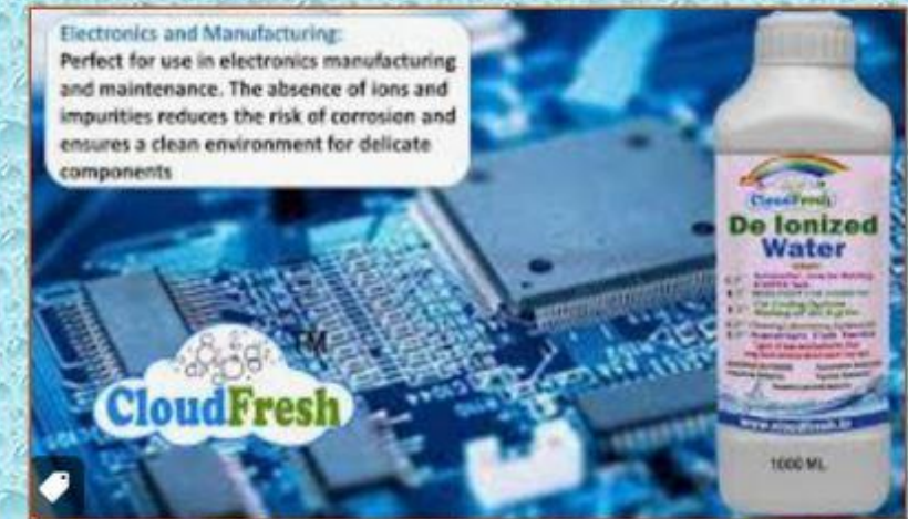
Demin Water for electronic industry