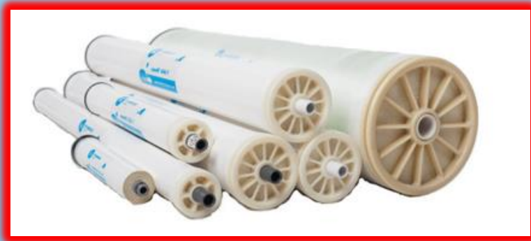
Membrane RO (Reverse Osmosis) (Sea Water, River Water and Brackish Water)