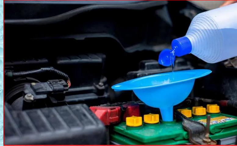
Demin Water for Automotive