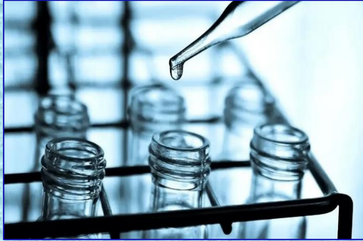
Demin Water for Laboratory