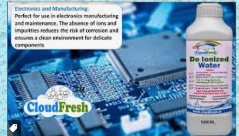
Demin Water for electronic industry