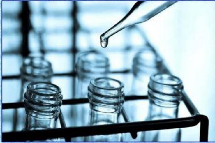
Demin Water for Laboratory