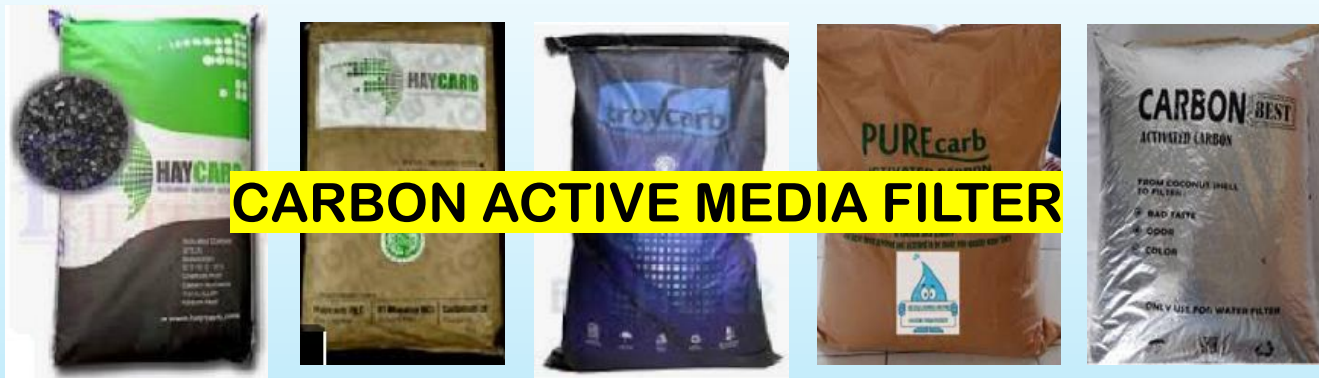
CARBON ACTIVE MEDIA FILTER