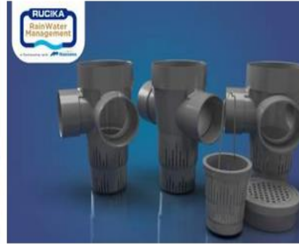
Rucika Rainwater Infiltration