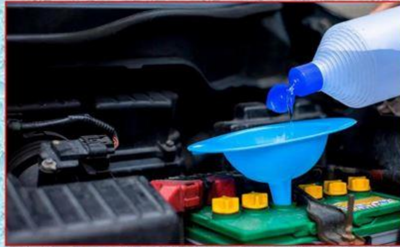
Demin Water for Automotive