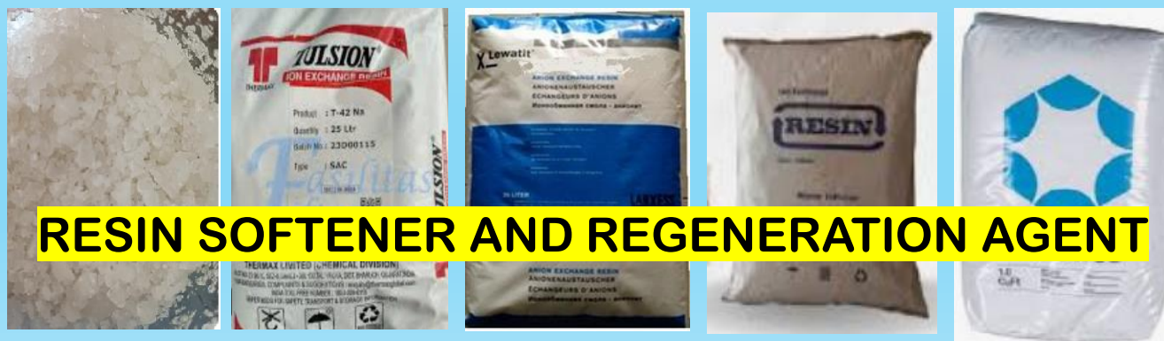
RESIN SOFTENER AND REGENERATION AGENT