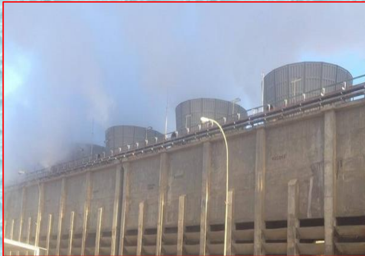
Demin Water for Cooling Tower