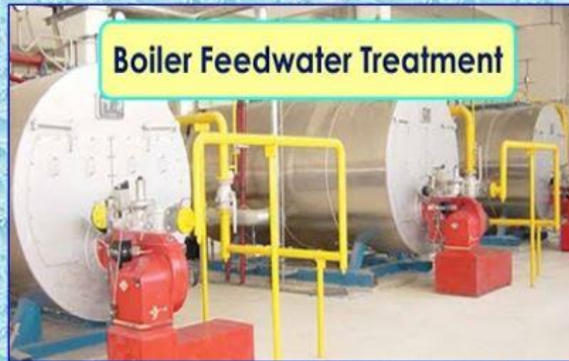
Demin Water for Steam Boiler Unit