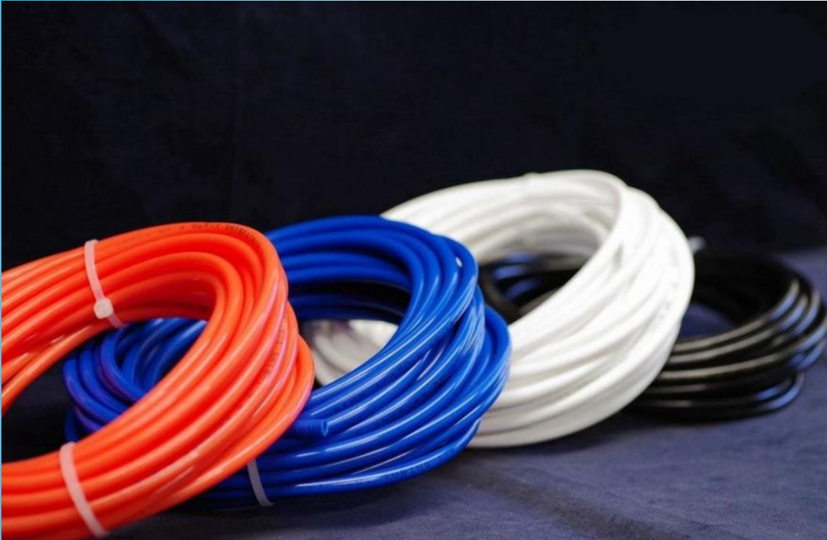
RO Fridge Water Filter Pipe Tube Hose 1/4" 6mm Tubing LLDPE High Pressure 10M Orange