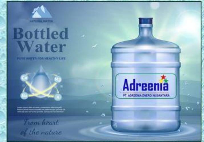
Demin Water for healthy drinking Water