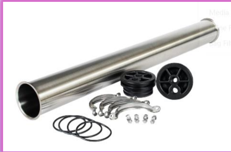
Stainless Steel RO Membrane Housings