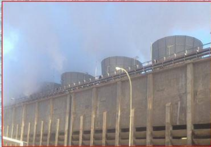
Demin Water for Cooling Tower