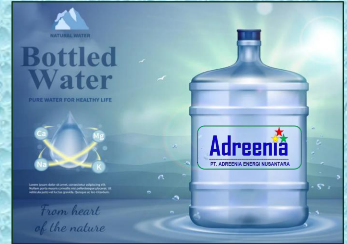
Demin Water for healthy drinking Water