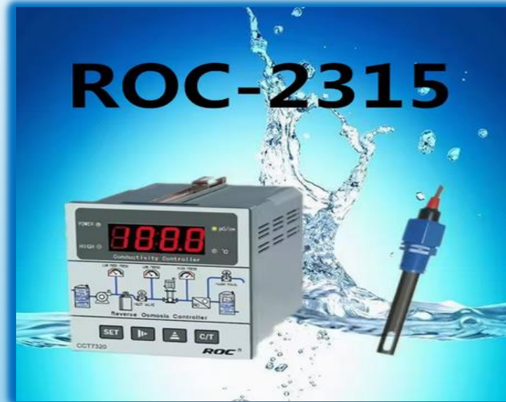
RO Micro Controller