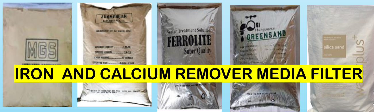
IRON AND CALCIUM REMOVER MEDIA FILTER