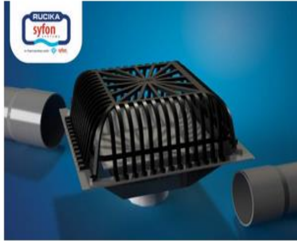
Rucika Syfon Systems