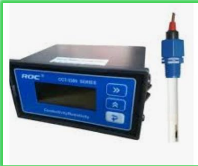
Online TDS Meter