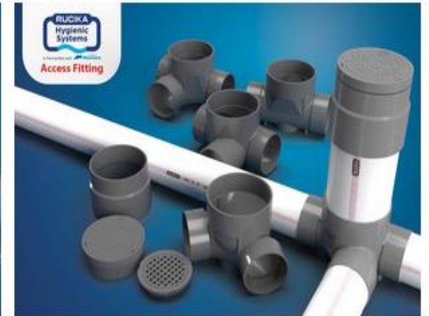
Rucika Hygienic System Access Fitting