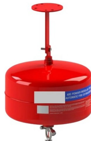
Modular Clean Agent

* Stored pressure & Cartridge type fire extinguishers available in dry chemical powder(ABC & BC) and water types.