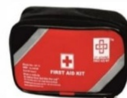
Tracelling/Mining First Aid Box