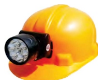
WITH LIGHT HELMET MODEL NO.: VH-7021