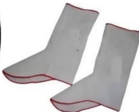
LEATHER LEG GUARDS