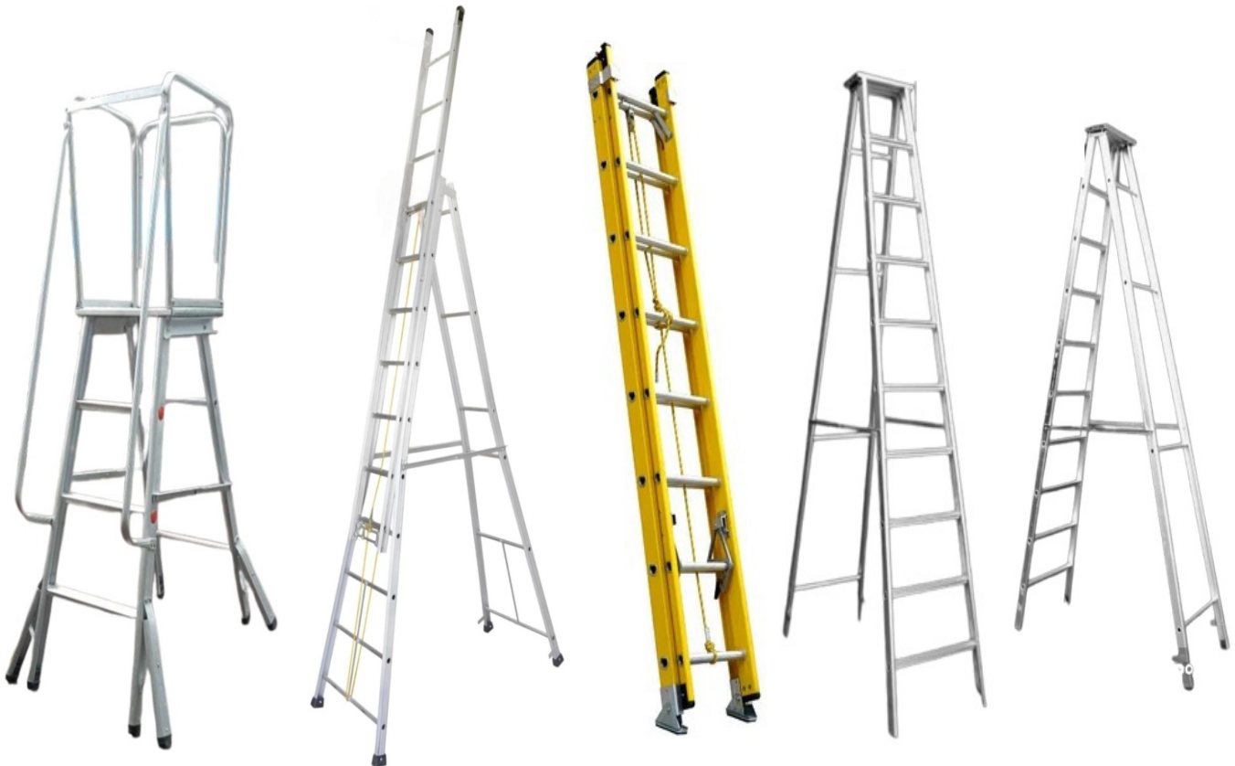
Al Step Ladder with Platform