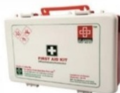
Office/Workplace First Aid Kit