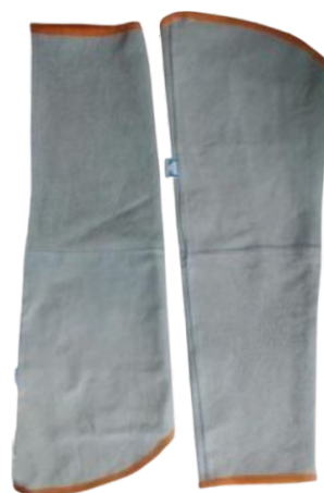
LEATHER HAND SLEEVES