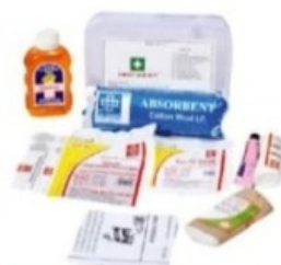
Two/Four Wheeler First Aid Kit