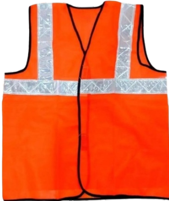
MODEL NO. VJ-001