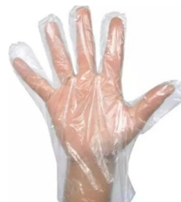
PLASTIC HAND GLOVES