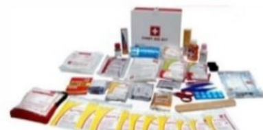
A/B/C Type First Aid Kit