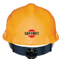
SAFETY HELMET WITH RACHET ADJUSTMENT H.D.P.E. IS : 2925 MODEL NO.: VH-1021