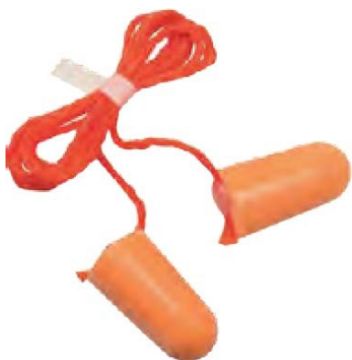
MODEL NO. VM - 2122 SNR 29DB