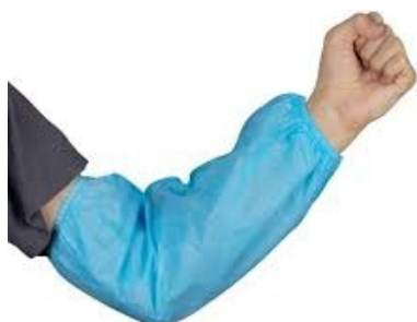
NONWOVEN SLEEVE COVER