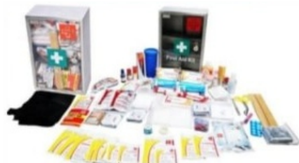
Stainless Steel First Aid Kit