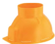
LOAD CARRYING HELMET H.D.P.E MODEL NO.: VH-6021