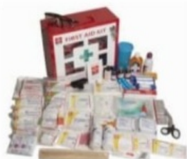
Industrial First Aid Kit (Designed as per Industrial Act)