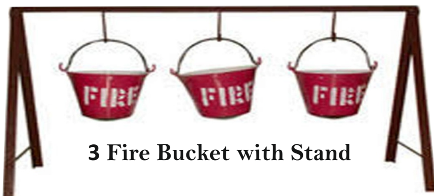
3 Fire Bucket with Stand