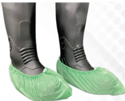
COMPOSTTABLE SHOE COVER