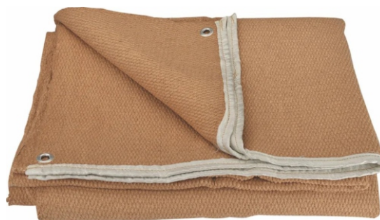
VERMICULITE - 1250° C