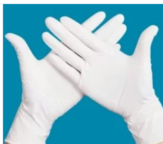
LATEX GLOVES POWERED & POWERED FREE