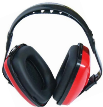
MODEL NO. VM - 3122 SNR 29DB