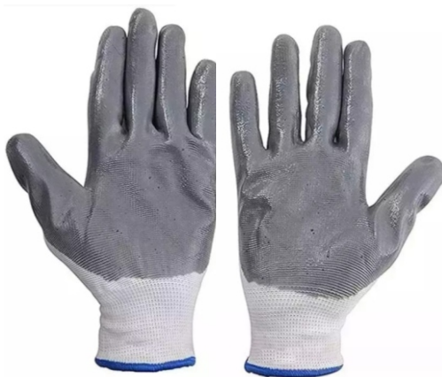
Anticut (Cut Level 1 to 5)