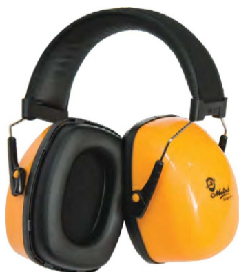
MODEL NO. VM - 4122 SNR 27DB