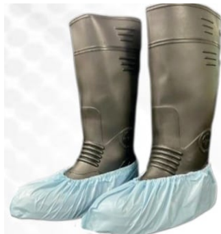
NON WOVEN BOOTIES