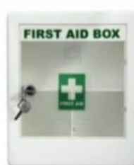
Plastic First Aid Box