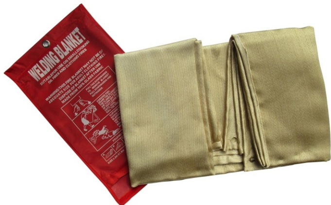
GLASS WOOL - 350° C