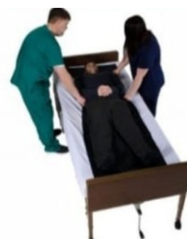
Patient Transfer Sheet