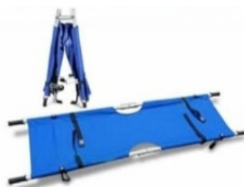
M.S. Folding Stretcher