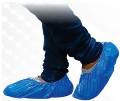
PLASTIC SHOE COVER