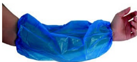
PE SLEEVES COVER