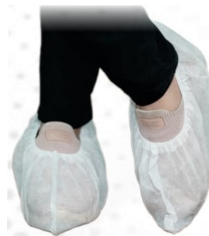
NON WOVEN SHOE COVER