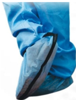
DISPOSABLE ANTISTATIC SHOE COVER