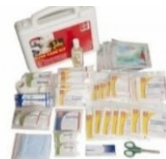
Burn Care Kit