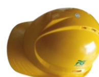
VENTILATION SAFETY HELMENT MODEL NO.: VH-8021