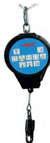
MODEL NO. RBFA-02