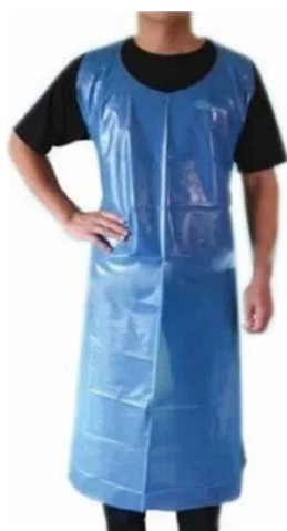
PLASTIC APRON HM/LD