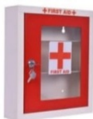
Burn Care Kit