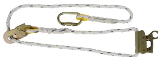
MODEL NO. WPRL-01