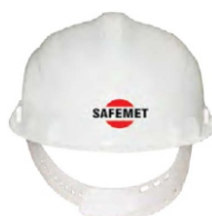
SAFETY HELMET WITH MANUAL ADJUSTMENT H.D.P.E. IS : 2925 MODEL NO.: VH-2021