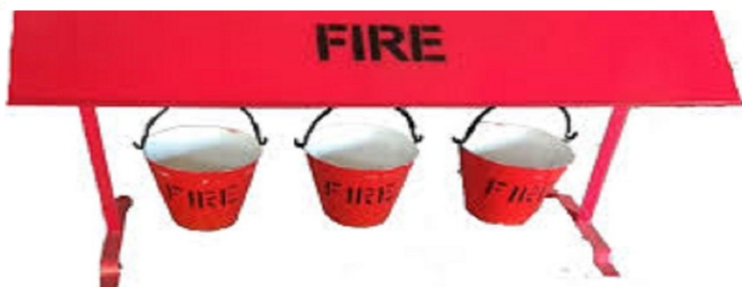
3 Fire Bucket Stand with Canopy