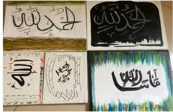
Calligraphy Showcase from the One Ummah Event