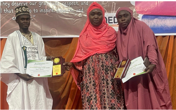
Best teachers of the year award.