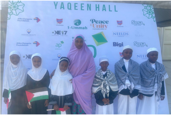
Our Choreography Students and Their Instructor