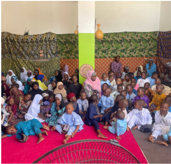
Hausa/Fulani Cultural Day.