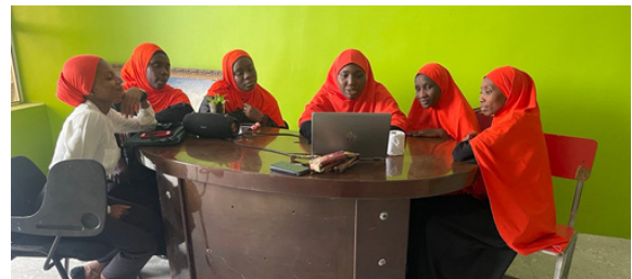
Strategic Learning: Elementary teachers & Principal

The term has been marked by thrilling enhancements to our curriculum and school framework, creating a more engaging and supportive learning atmosphere for everyone. We are steadily progressing toward our architectural vision and making it a reality.