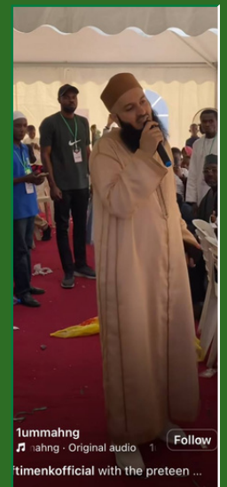
lummahng lummahng - Original audio timenkofficial with the preteen ...