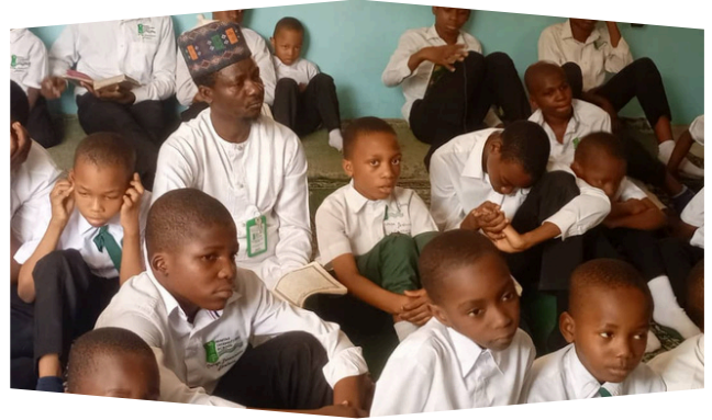
Tafsir on going...