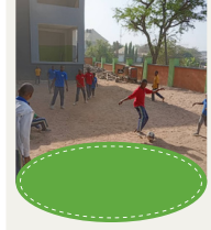
Our School Sport houses doing their thing on sport day

To nurture spiritual growth, every Friday , students gathered for the recitation of Suratul Kahf , reinforcing the virtues of reflection and seeking Allah's light in their lives.