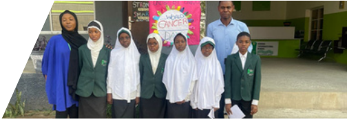
International Days Celebrated!