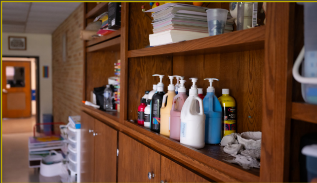
Art supplies are stored in several locations as they are available. A dedicated space would allow classroom and closets to be utilized for teacher's books & materials.