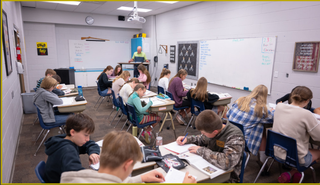
What once was the computer lab makes for a very narrow, cramped, make-shift classroom for upper grades. The narrow space requires students to push desks together.