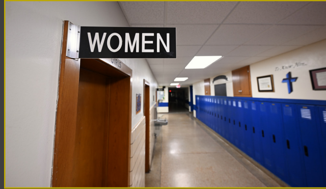
One of 4, outdated and non-ADA compliant bathrooms