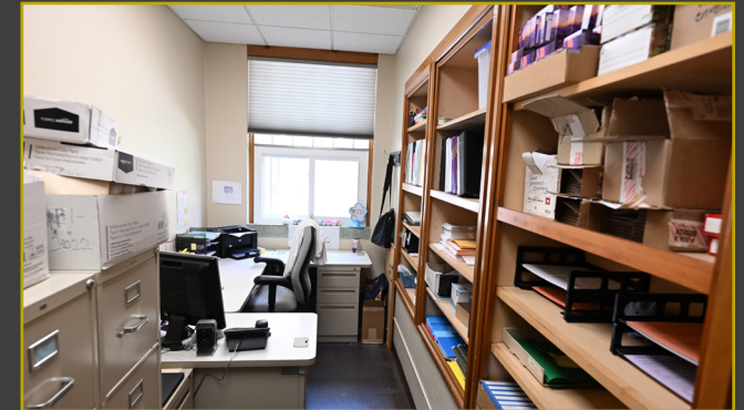
The smallest office we have! With the addition of an Associate Pastor and DCM, all offices are now used by church staff. Our principal will need a new office!