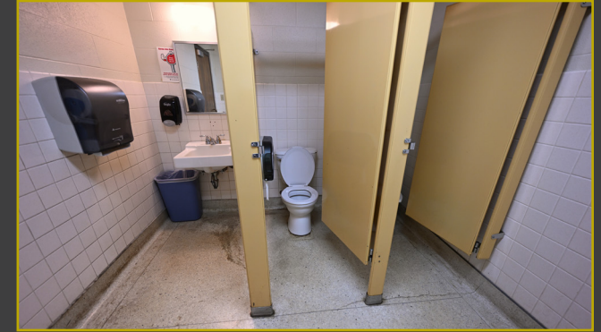
One of 4, outdated and non-ADA compliant bathrooms