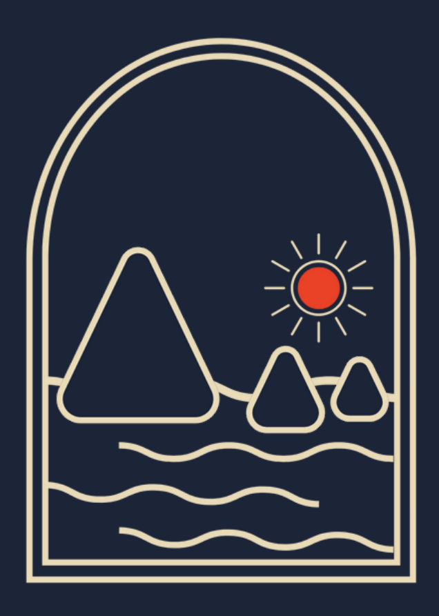
Aloka Penida Sunrise Point