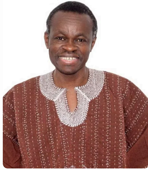
Professor PLO Lumumba