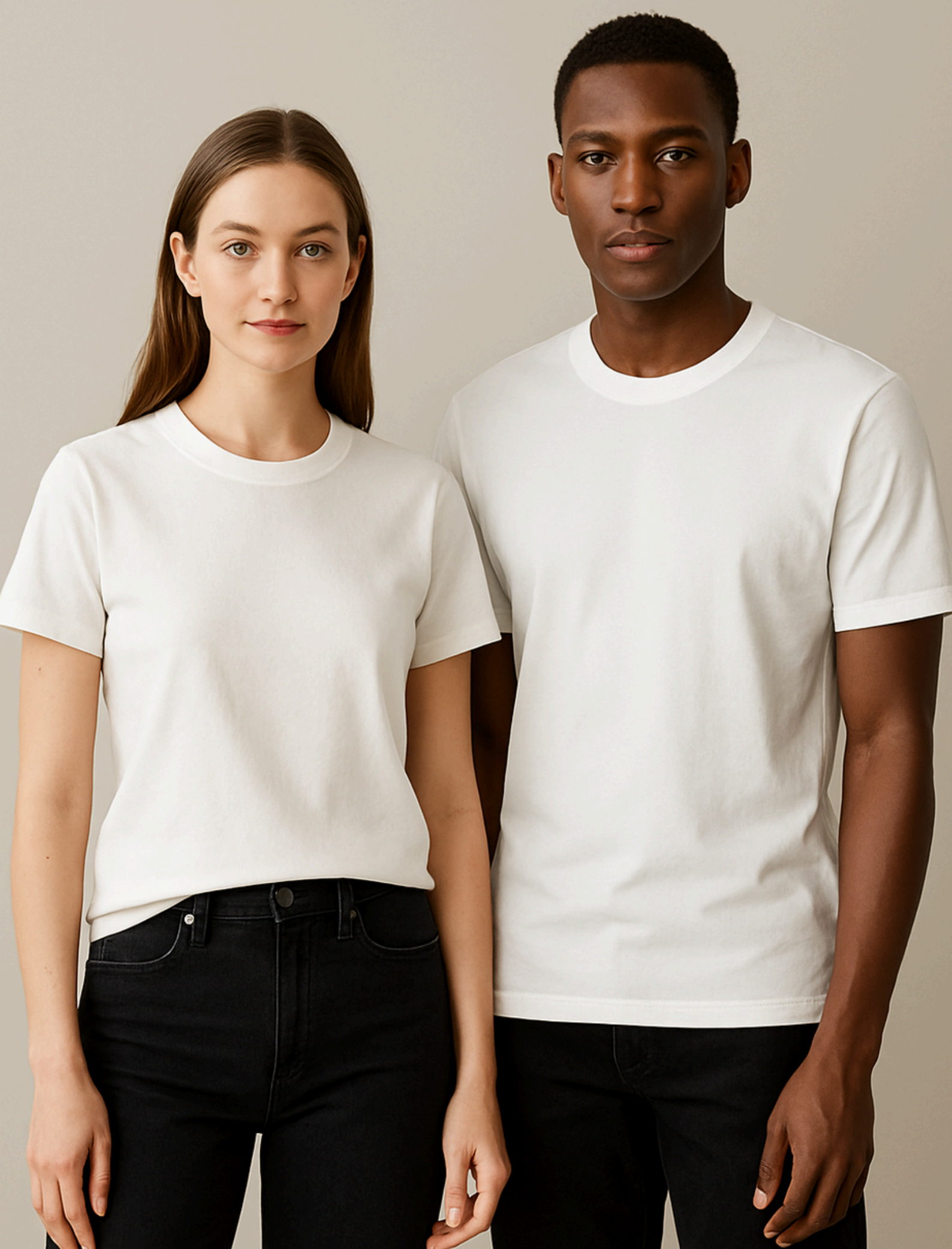
Round Neck T-shirts