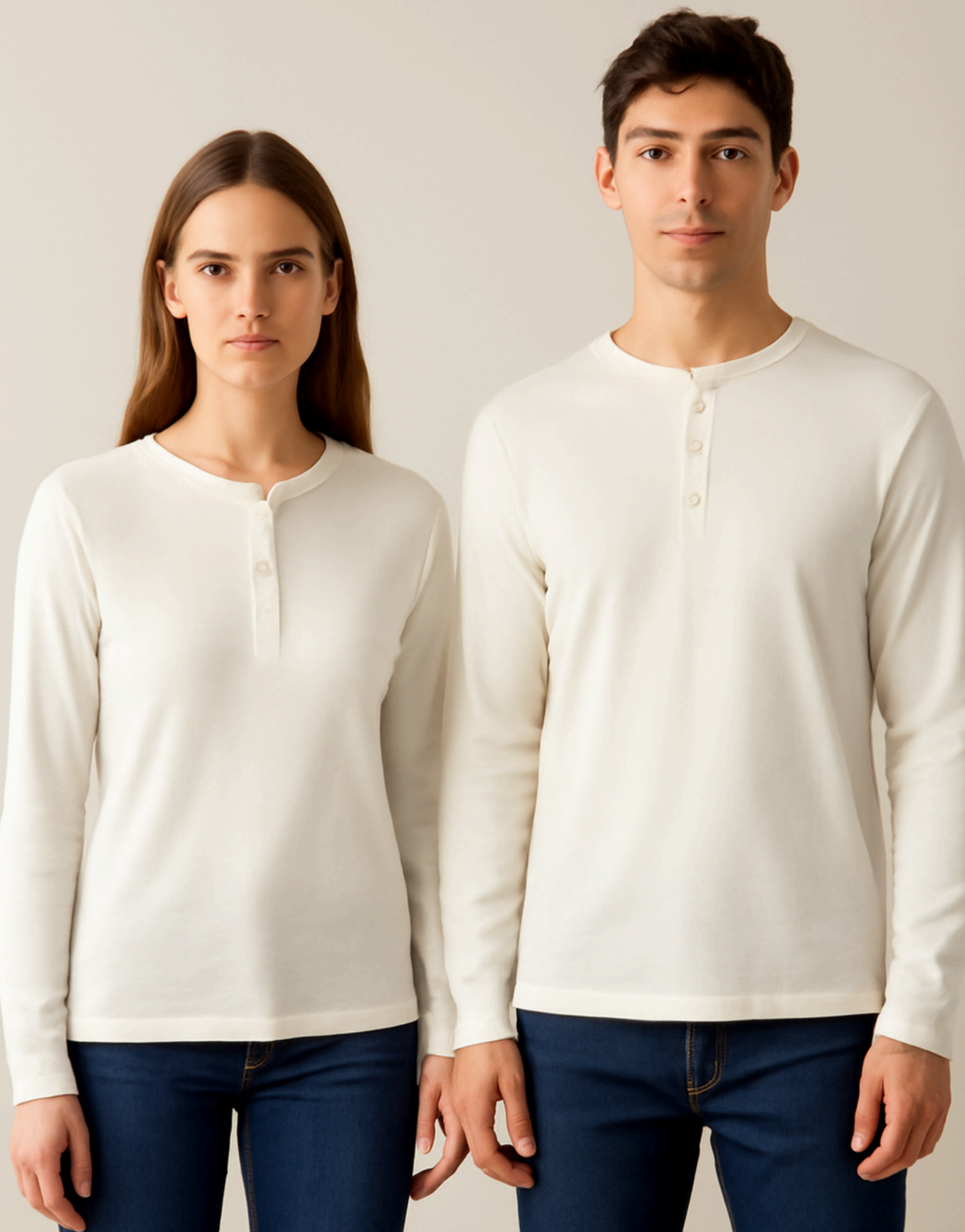
Henley Neck T-Shirts 9