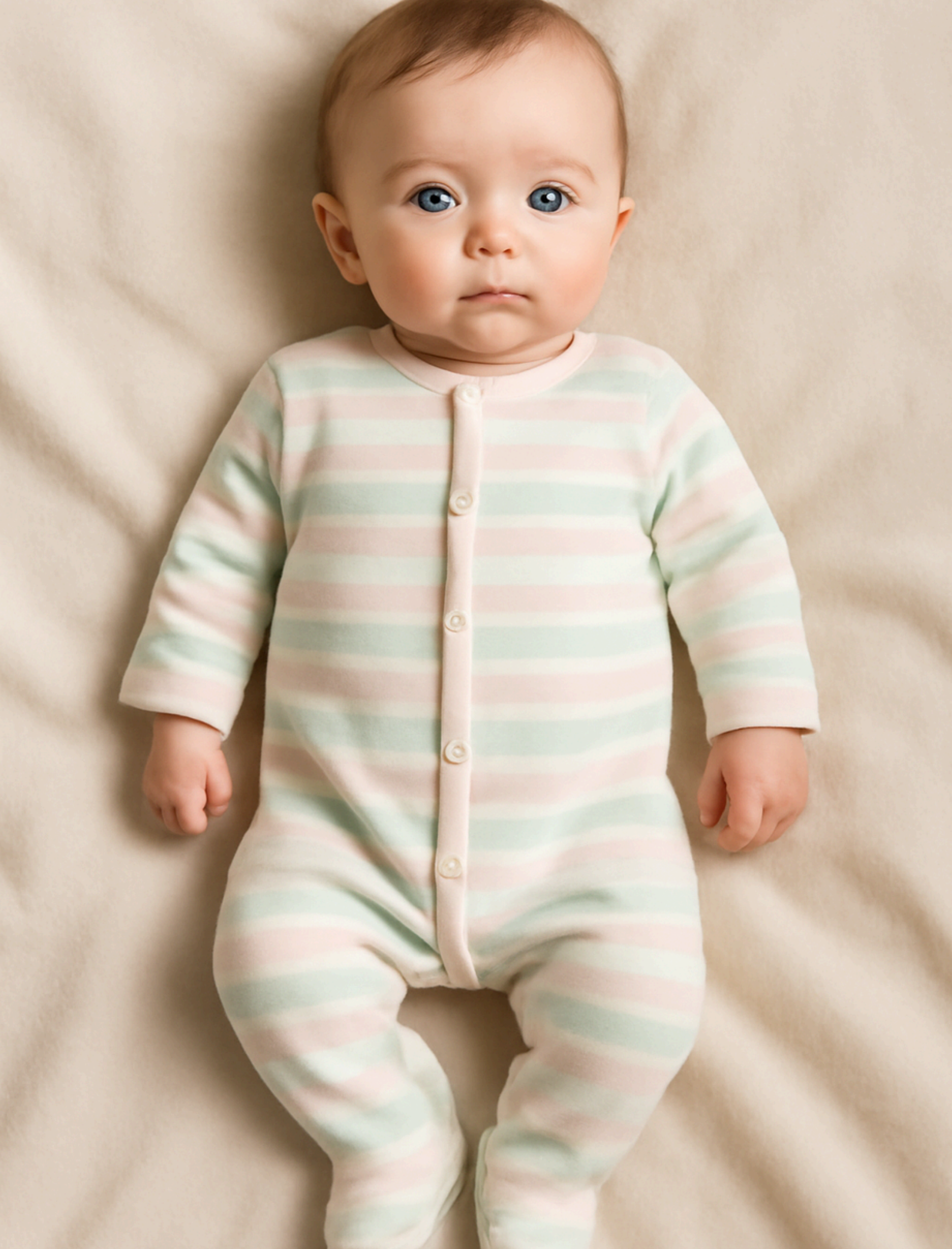
Baby Sleep Suit