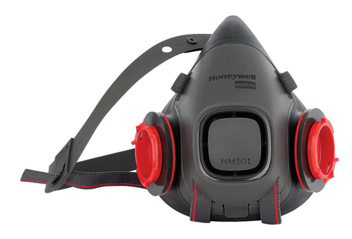
HM501, non-drop-down version