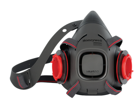
HM502, drop-down version