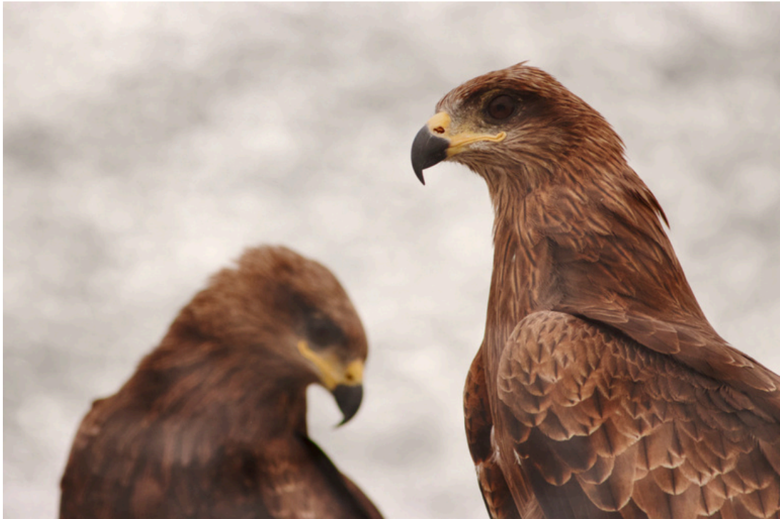
Two of a Kind. Archival print on canvas, 52 x 78 cm. Serampore, 2025.