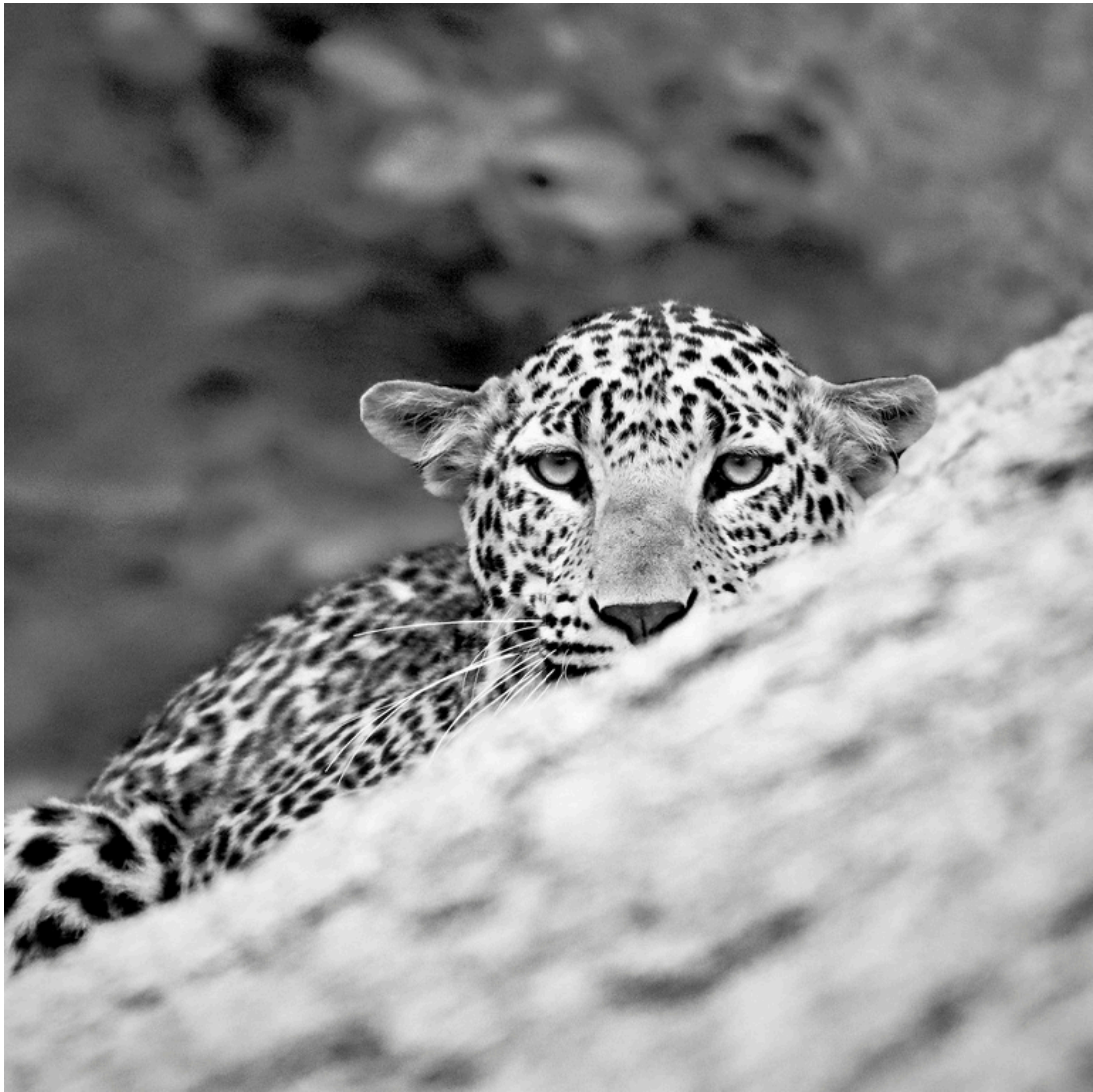
Leopard on a Rock. Archival print on canvas, 66 x 66 cm. Jawai, 2024.