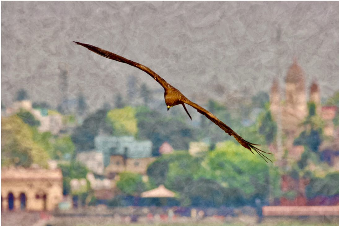
The Kite from the Temple. Archival print on canvas, 52 x 78 cm. Serampore, 2026.