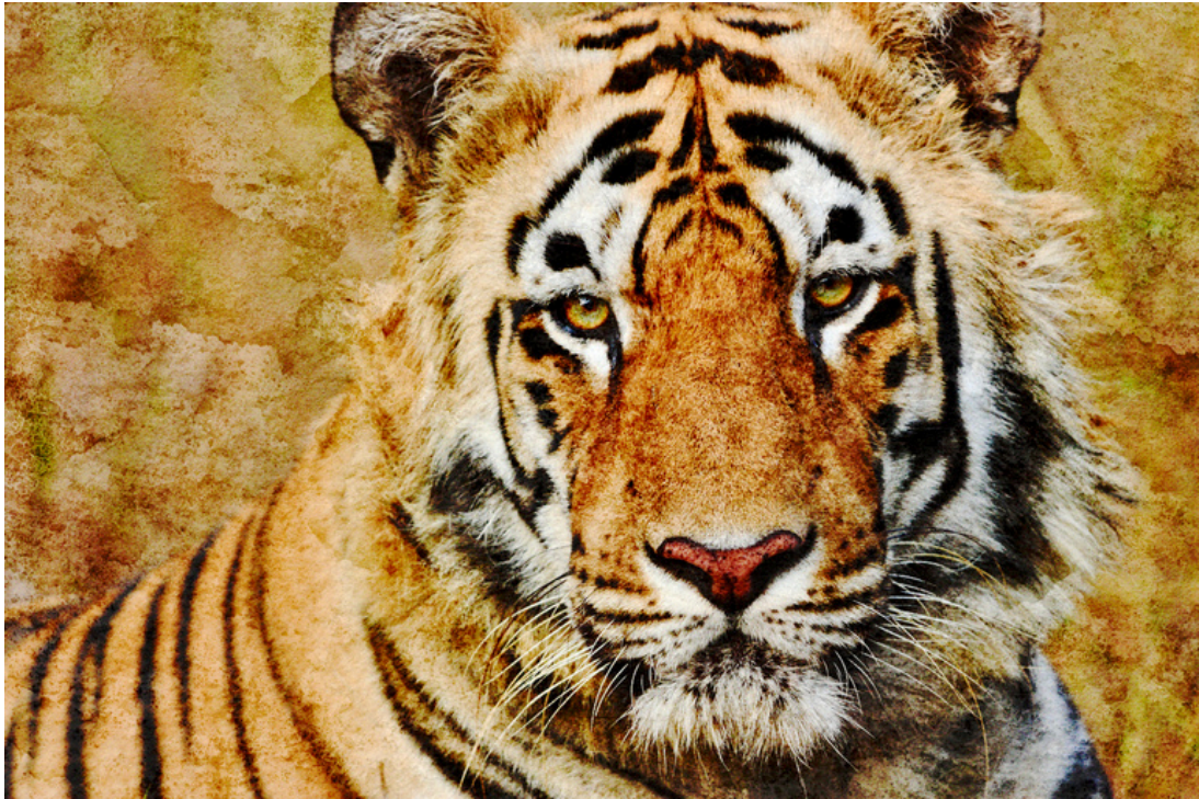
A Portrait of Chota Dadiyal. Archival print on canvas, 52 x 78 cm. Tadoba, 2025.