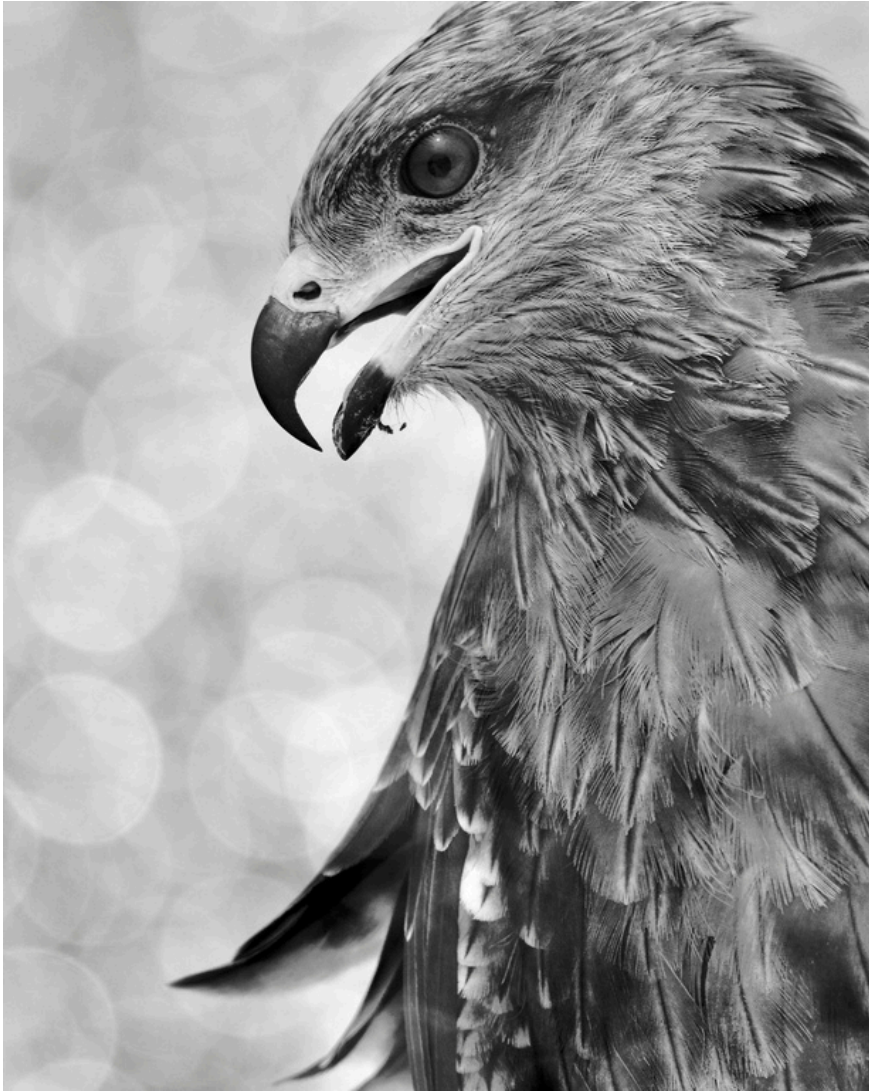
My Friend. Archival print on canvas, 75 x 60 cm. Serampore, 2024.