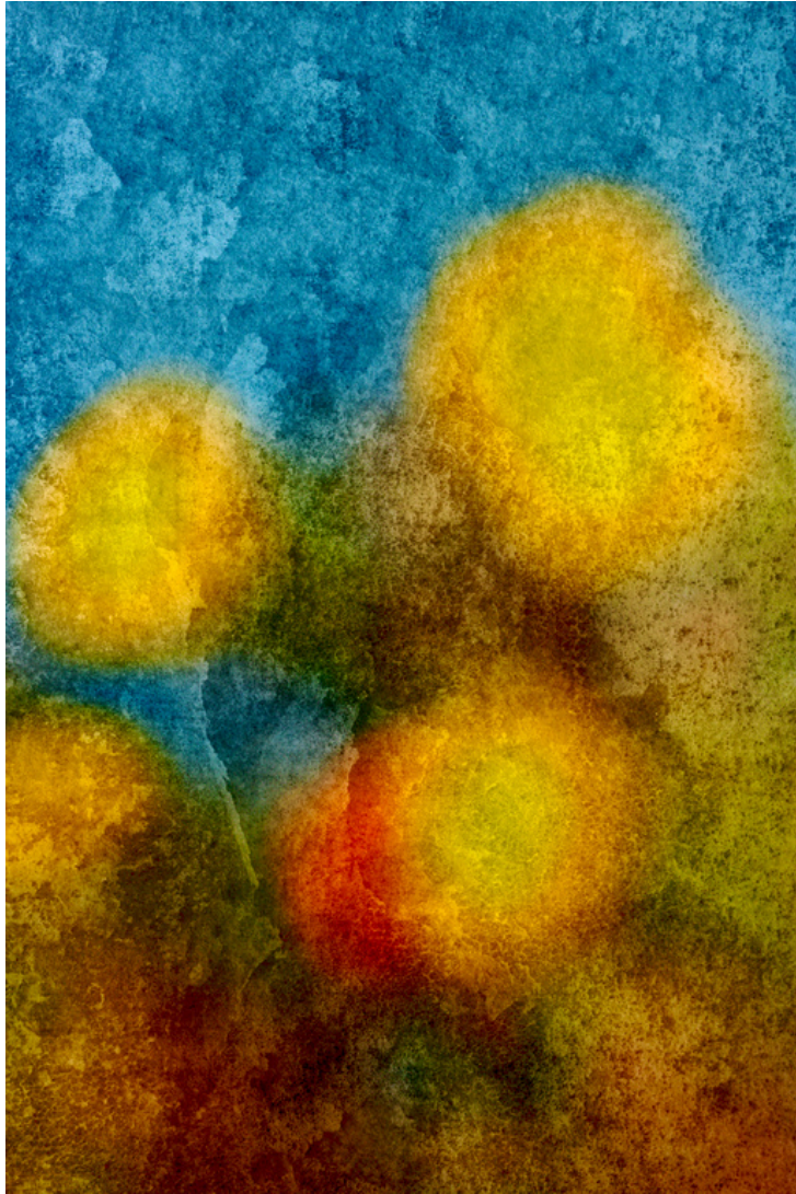
Marigolds. Archival print on canvas, 75 x 50 cm. Serampore, 2026.