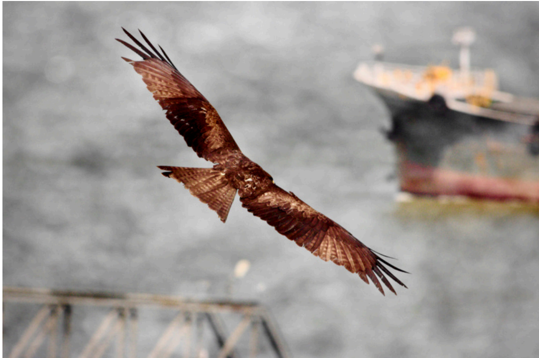
The Kite, the Bridge and the Boat. Archival print on canvas, 52 x 78 cm. Serampore, 2026.