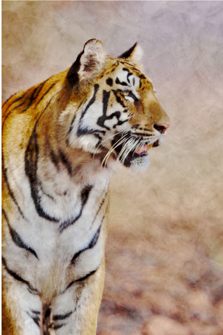
Tigress by the Lake. Archival print on canvas, 75 x 50 cm. Tadoba, 2025.