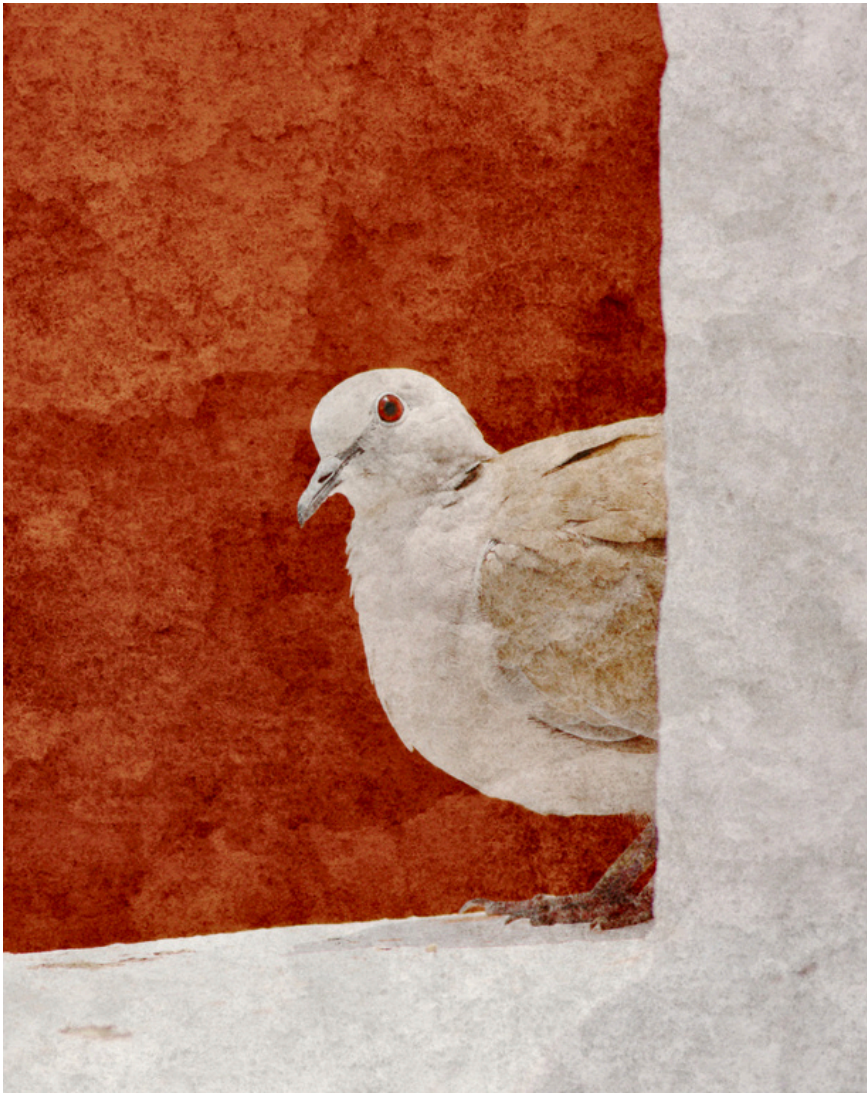
The Shy Dove. Archival print on canvas, 75 x 60 cm. Serampore, 2024.