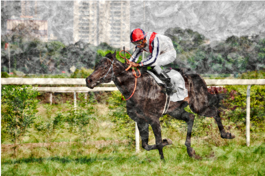
Abhicandra Wins the Air Force Cup. Archival print on canvas, 46 x 69 cm. Kolkata, 2026