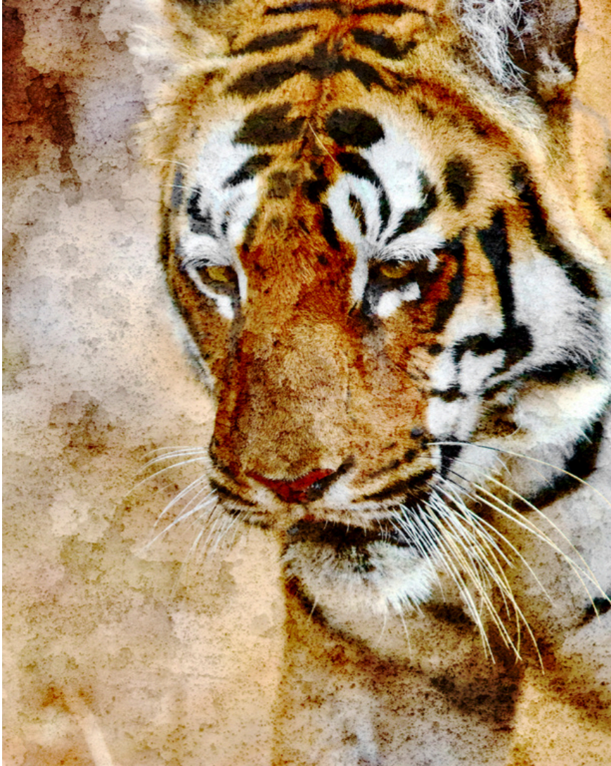
Lost in Thought. Archival print on canvas, 75 x 60 cm. Tadoba, 2025.