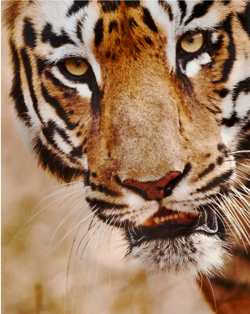
Fear and Wonder in Tadoba. Archival print on canvas, 75 x 60 cm. Tadoba, 2025.