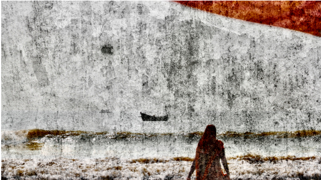
Woman at the Beach. Archival print on canvas, 45 x 80 cm. Orissa, 2025.