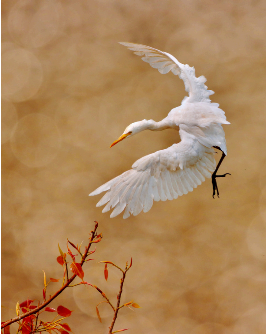
The Egret. Archival print on canvas, 75 x 60 cm. Serampore, 2024.