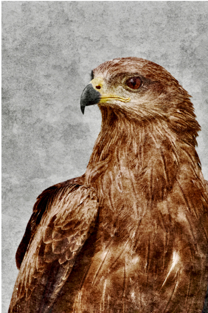
The Prince. Archival print on canvas, 75 x 50 cm. Serampore, 2024.