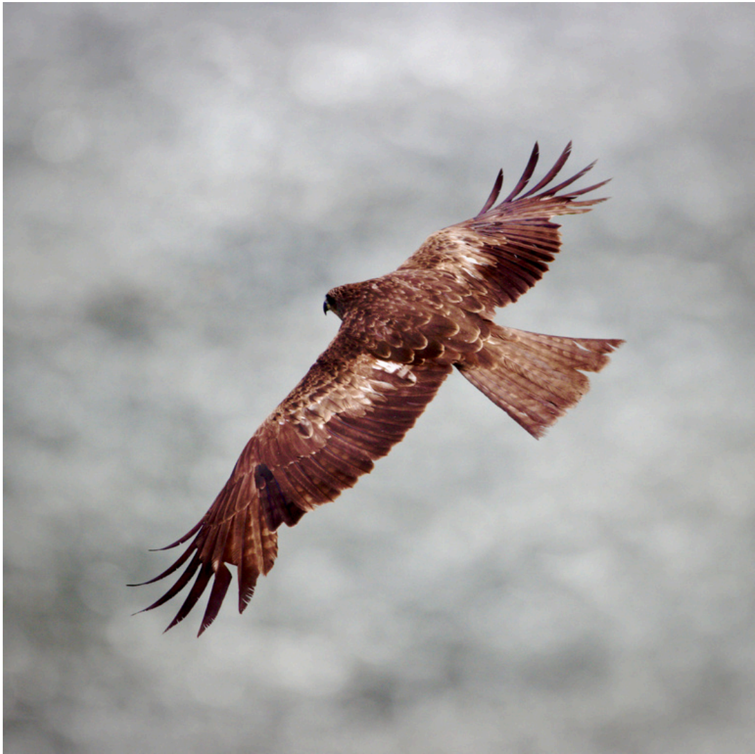
Alone above the Fog. Archival print on canvas, 66 x 66 cm. Serampore, 2026.