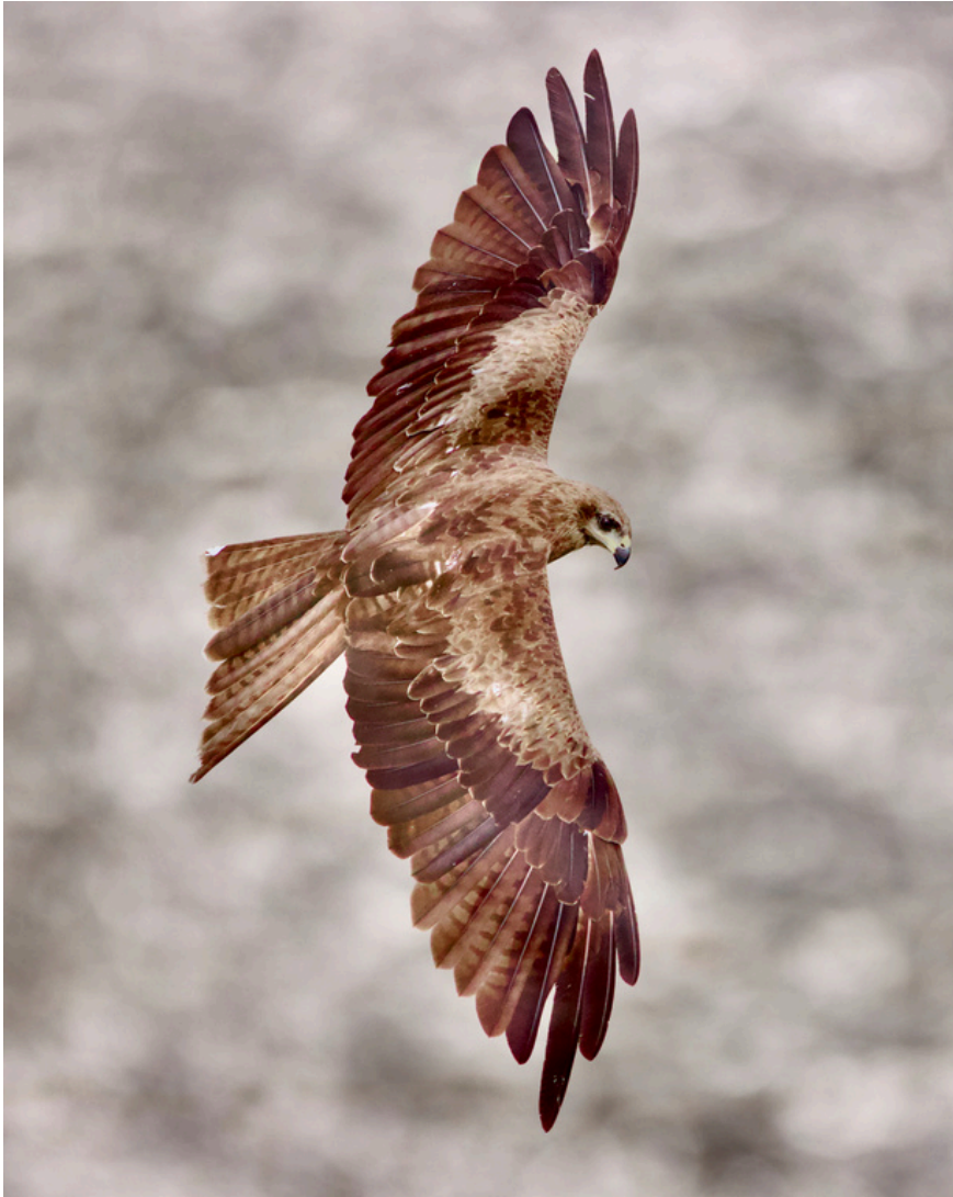
Wings over Water. Archival print on canvas, 75 x 60 cm. Serampore, 2025.