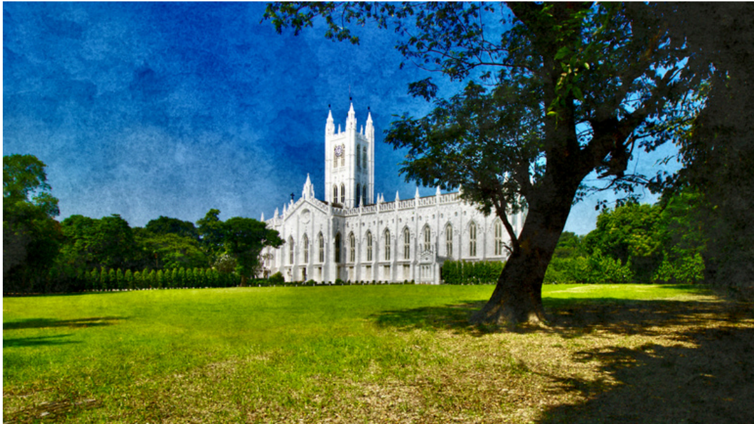
The Light of Calcutta. Archival print on canvas, 45 x 80 cm. Kolkata, 2025.