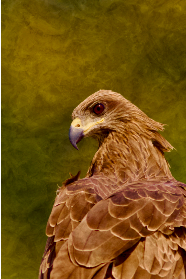
Can I Trust You? Archival print on canvas, 75 x 50 cm. Serampore, 2025.