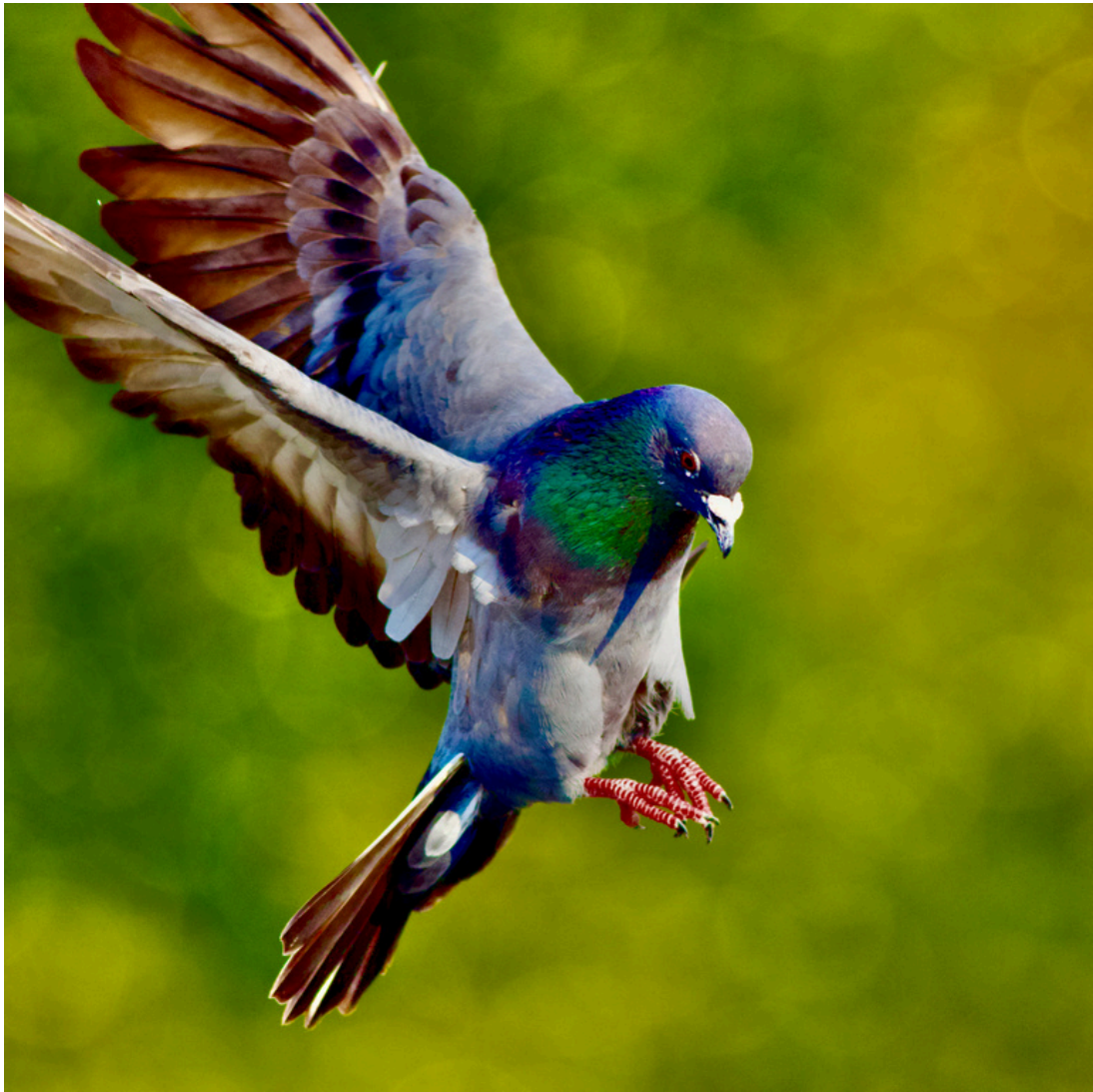
Colours in the Sun. Archival print on canvas, 66 x 66 cm. Serampore, 2025.