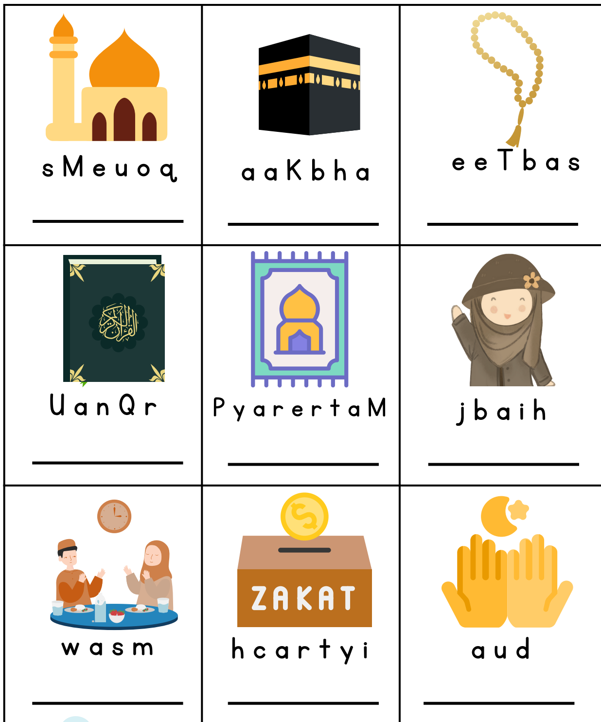
Figure out what the word is and write it on the blank provided.