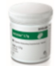
Actichlor 1.7g Disinfection Tablets

Used for: Disinfection of Surfaces, Note with the exception of blood spillage, surface to be cleaned first prior to using Actichlor