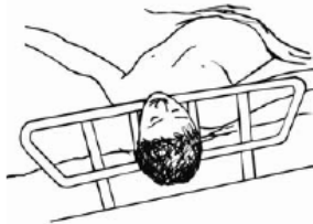
Zone 1 – Entrapment within the rail