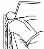
Zone 6 – Entrapment between the end of the rail and the side edge of the head or foot board