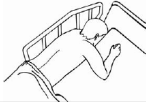
Zone 3 – Entrapment between the rail and the mattress