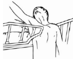
Zone 5 – Entrapment between split bed rails