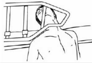
Zone 4 – Entrapment under the rail, at end of rail