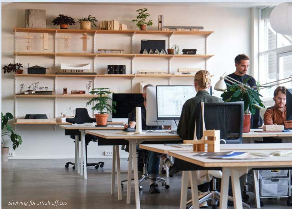
Shelving for small offices