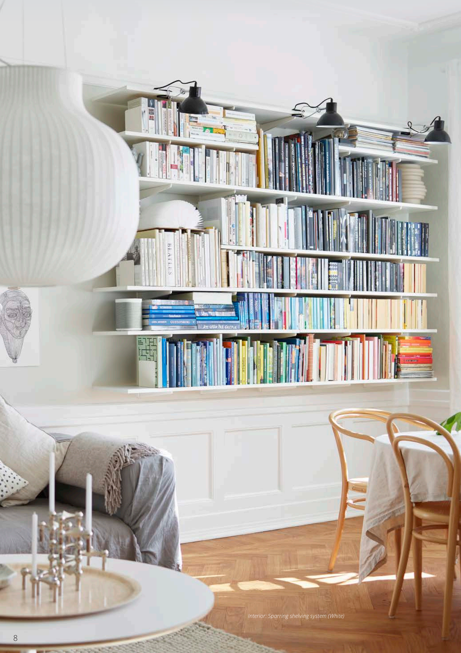
Interior: Sparring shelving system (White)