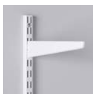
Bracket and shelf.