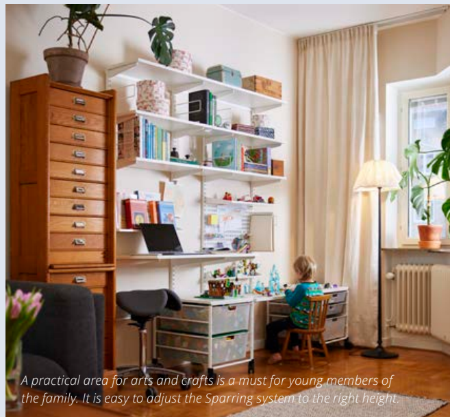
A practical area for arts and crafts is a must for young members of the family. It is easy to adjust the Sparring system to the right height.

The Sparring shelving system is also ideal for storage in professional settings.