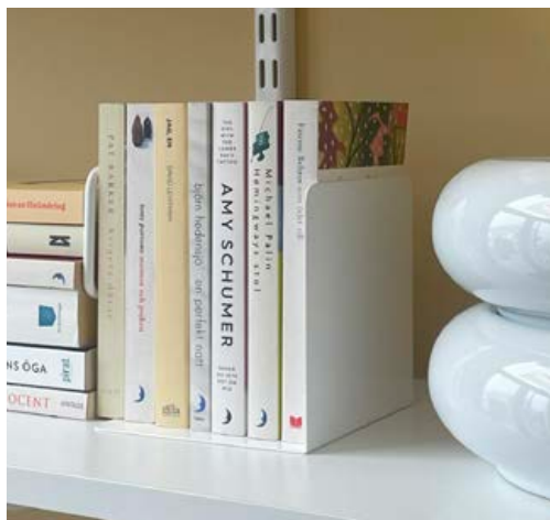
Free-standing book support to place on the shelf.