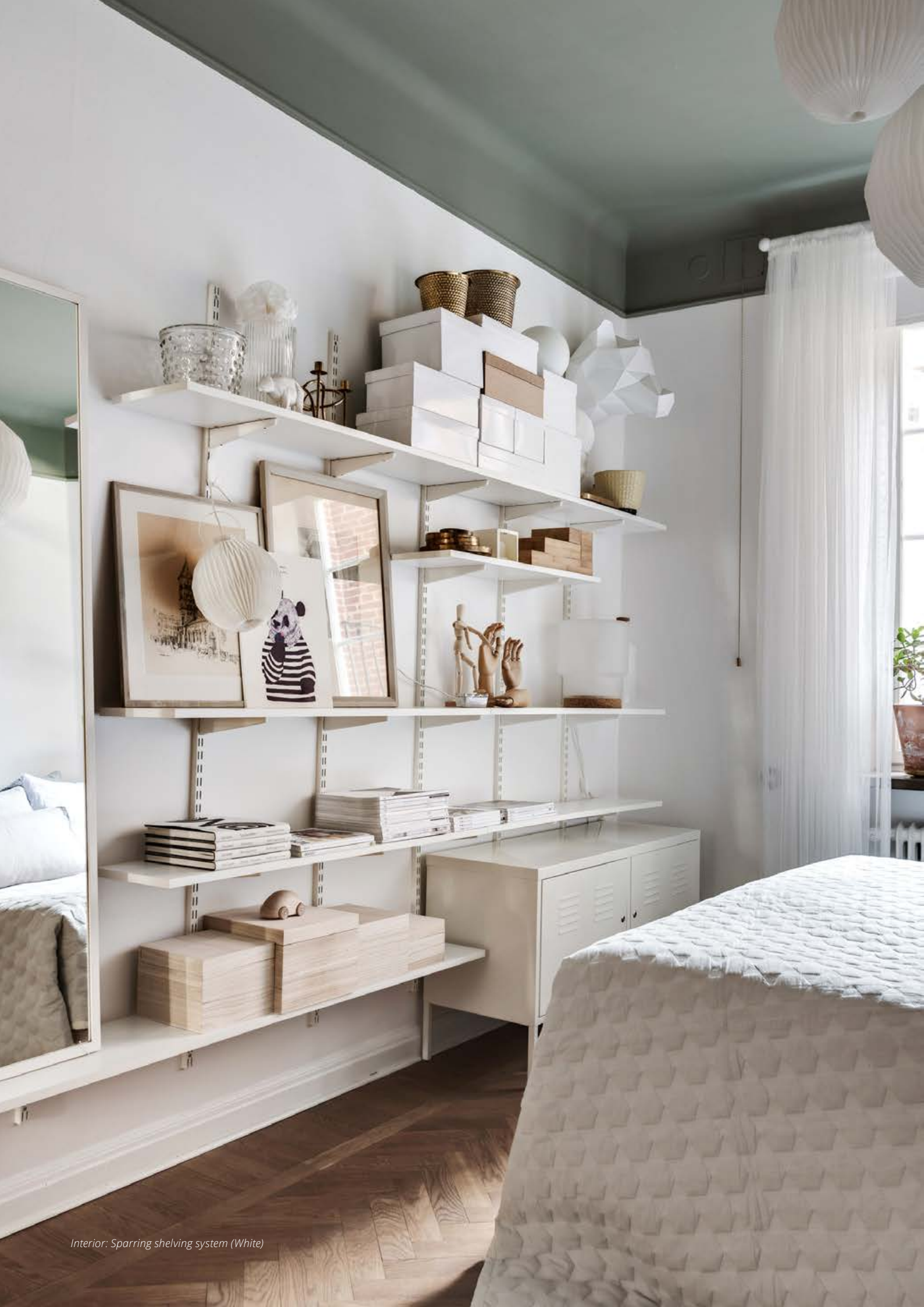
Interior: Sparring shelving system (White)