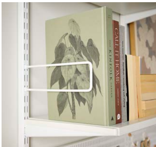
Book support for hang standards.