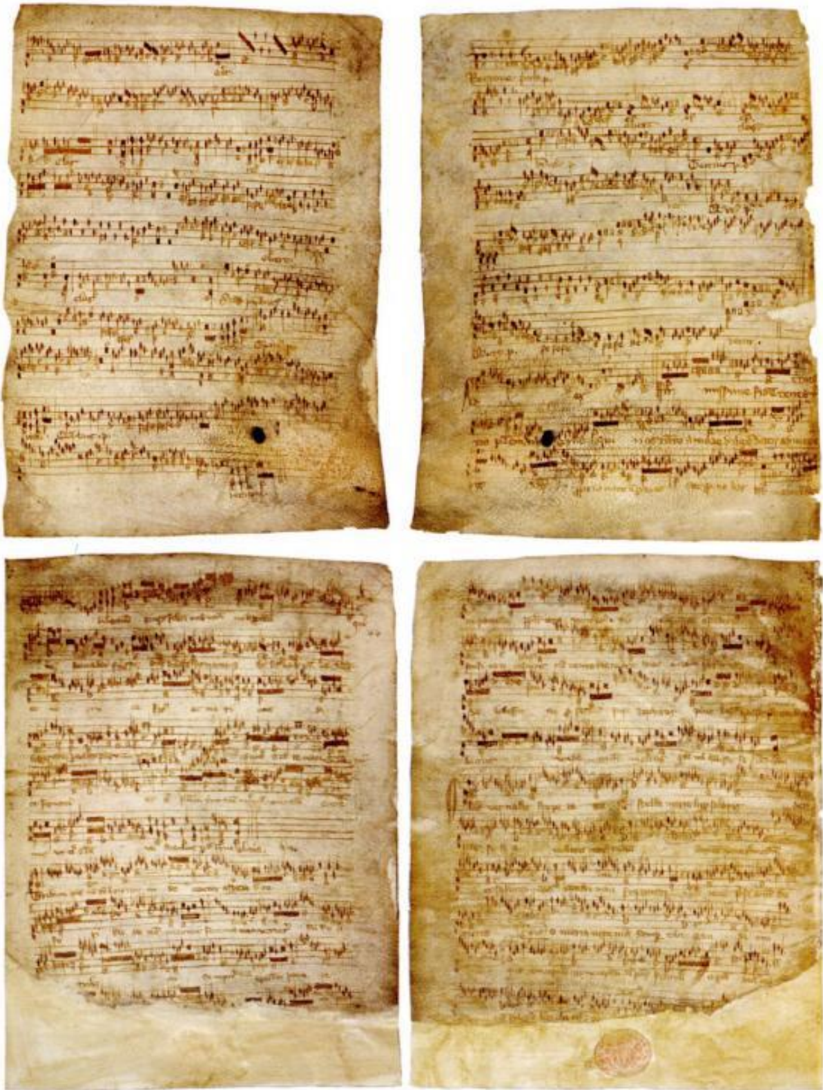
4 of the music pages in the Robertsbridge Codex