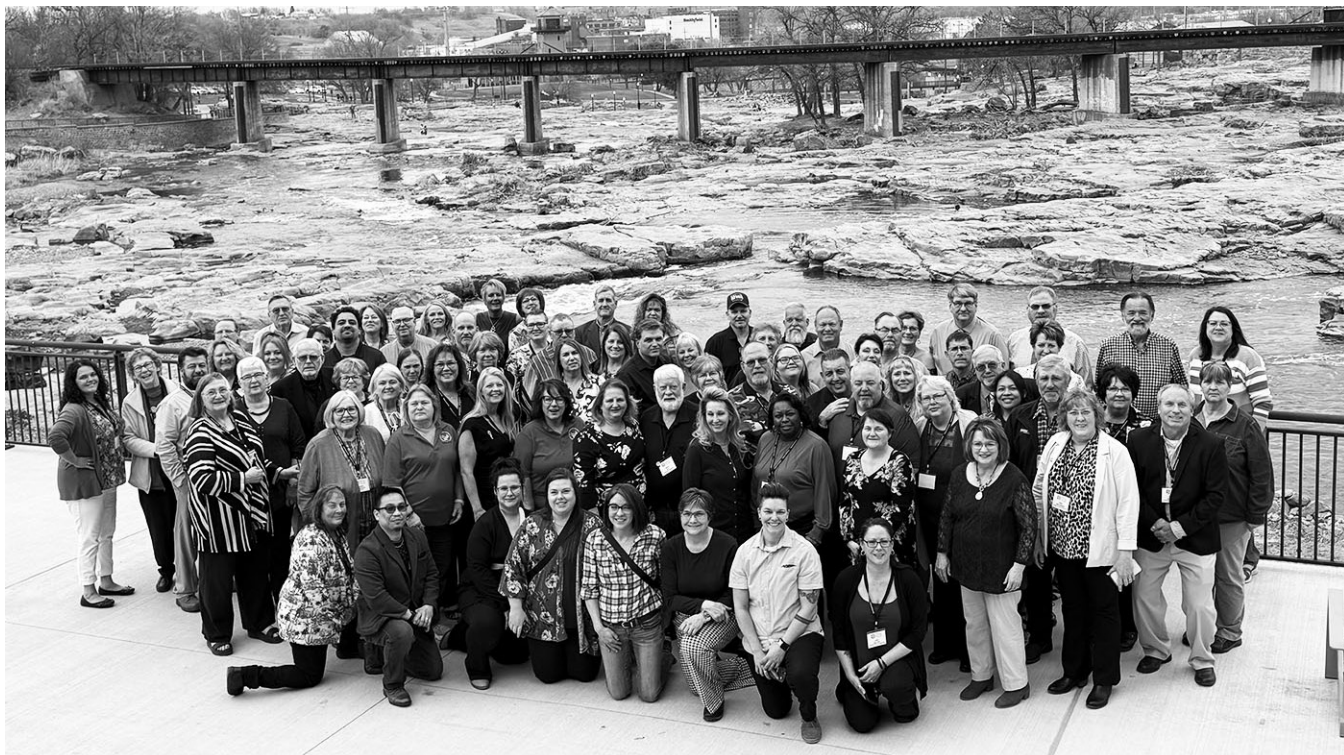
IA-NE-SD 2025 Tri-State Convention Attendees