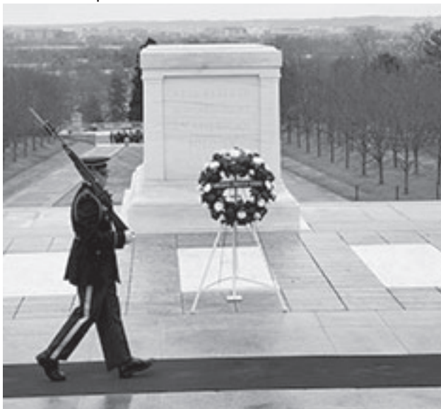
Tomb of the Unknown Soldier