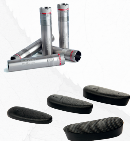
Fabarm offers various recoil pad sizes on their website to customize your LOP without the need for gunsmithing.

I came back from the range and spoke to the Fabarm reps about my overall conclusion. I would love to put one of these in the hands of each new shotgunner, confident that we could walk through the early stages of the learning curve and leave without the need to find a more capable shotgun any time in the foreseeable future. This one is a keeper. ■