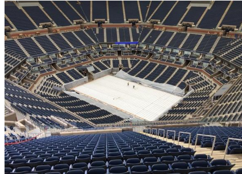
Roof section replacement at Arthur Ashe Stadium, Flushing Meadows, New York.