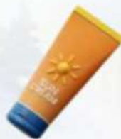
Sunscreen, Moisturiser & Lip balm