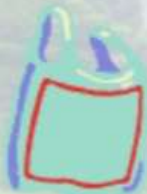
One polybag to keep waste (Let's keep the mountains clean)