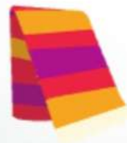
One small blanket/sheet/shawl for the journey time