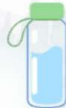
Reusable water bottle