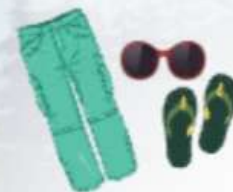
Personal belongings, loose track pants/lower, dark shade Goggles, slippers, and toiletries