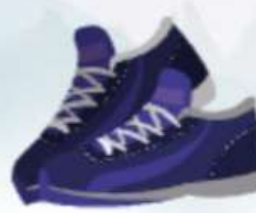
Good Trekking/Sports Shoes