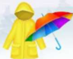
Raincoat/Umbrella (preferable; weather in the mountains is uncertain)