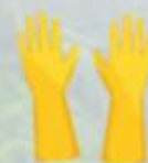
Reusable hand gloves (if needed)