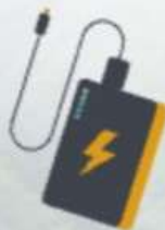
Power bank (preferred)