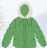
One warm jacket and other woollen items