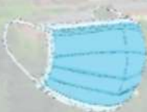
Extra Reusable Masks