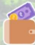
Cash for personal use (ATMs in the mountains are generally out of cash)