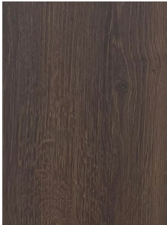
TEAK OVER | AQ-7001

The image of the product may vary screen to screen. Please refer to the physical catalog before placing the final order.