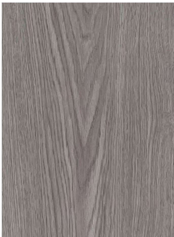
NATURAL BEIGE | AQ-7004

The image of the product may vary screen to screen. Please refer to the physical catalog before placing the final order.