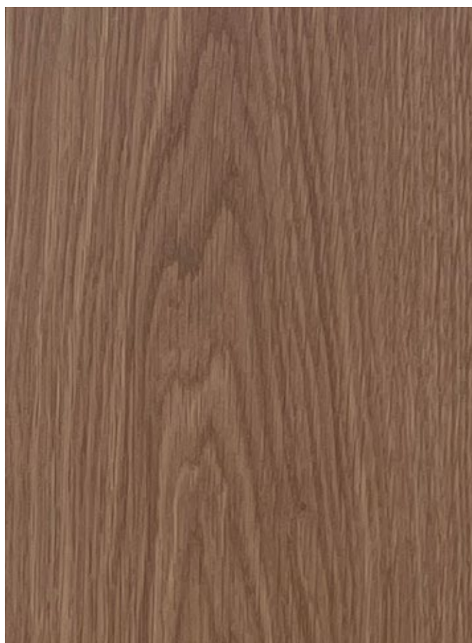
WARM PEACH | AQ-7006

The image of the product may vary screen to screen. Please refer to the physical catalog before placing the final order.