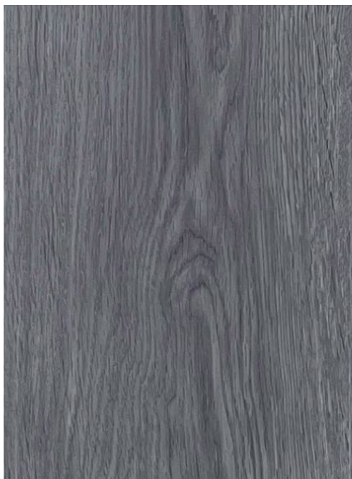
METROPOLIS GREY | AQ-7005

The image of the product may vary screen to screen. Please refer to the physical catalog before placing the final order.