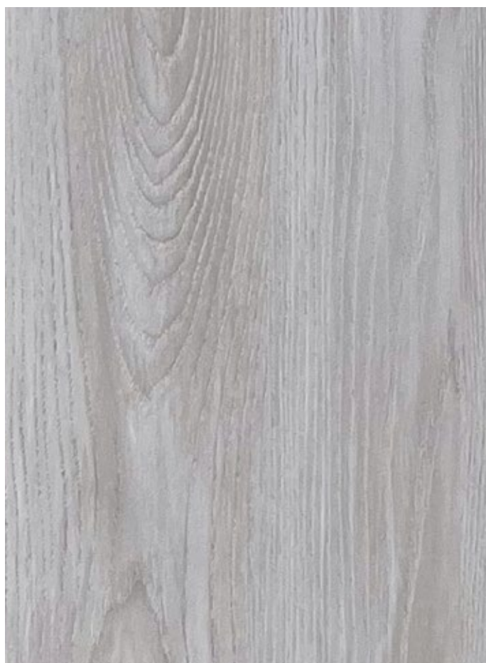
COCONUTTY | AQ-7003

The image of the product may vary screen to screen. Please refer to the physical catalog before placing the final order.