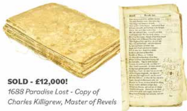
SOLD - £12,000! 1688 Paradise Lost - Copy of Charles Killigrew, Master of Revels