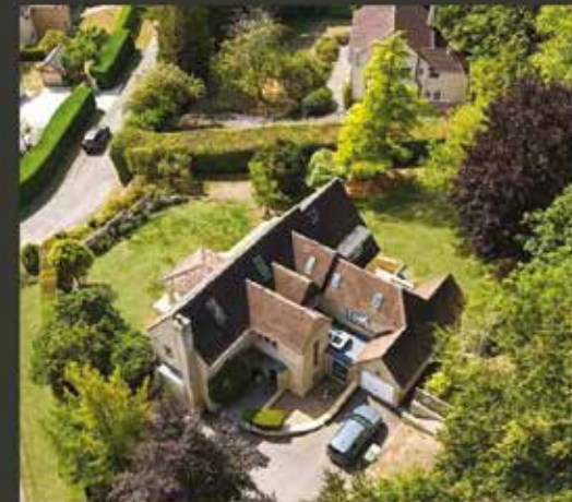
High Bannerdown O.I.E.O £1.5m