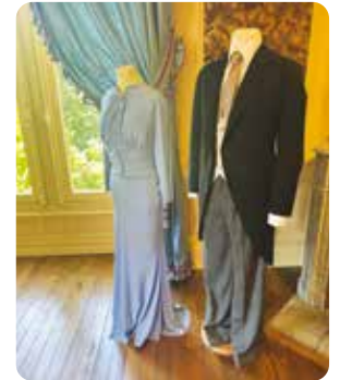
Copies of the wedding outfits worn by Duke of Windsor and Wallis Simpson