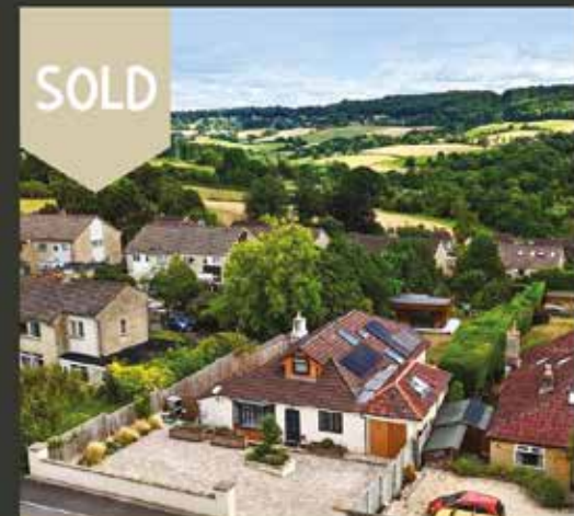
Morris Lane, Bathford O.I.E.O £1m