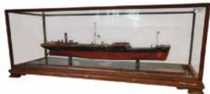
SOLD - £6,500! Vintage early 20th century glass cased model SS Brimsdown ship collier