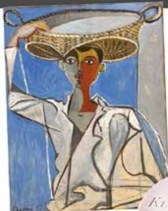
SOLD - £39,000! John Craxton (1922-2009) - Fish hawker with basket 1951 tempera on paper

To arrange a home visit, please call, email or go to our website.