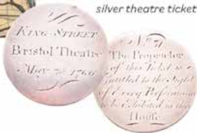
SOLD - £8,600! 1766 Bristol Old Vic silver theatre ticket