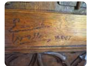
'Graffiti' carvings of their names on the fire surround