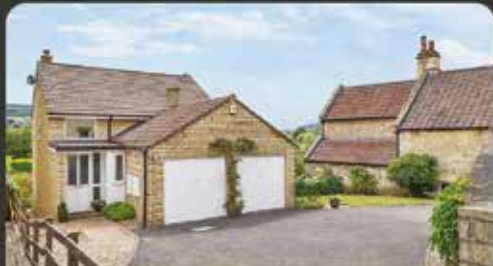
Batheaston O.I.E.O £700,000