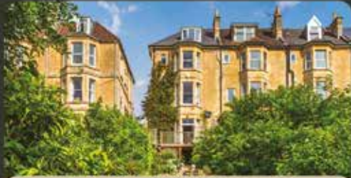
Batheaston O.I.E.O £1,000,000