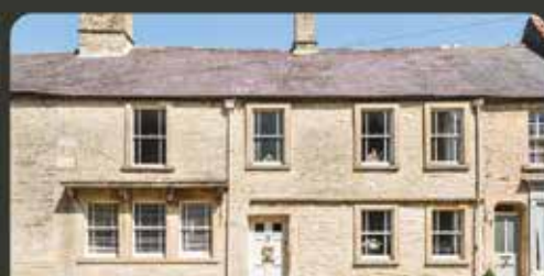
Marshfield O.I.E.O £800,000