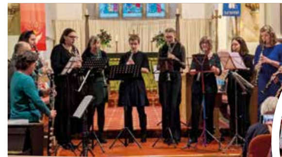
Ebonite Clarinet Ensemble

This is where you might come in! Do you play an instrument, sing, or perform with a group that would like to take part? If so, we would love you to be in touch! Performance times can be from 10 - 30 minutes, so if you just want to perform one or two short pieces - or a longer programme - we can accommodate you. Get in touch by emailing: m@ureenbreeze.co.uk