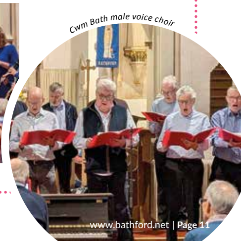
Cwm Bath male voice choir