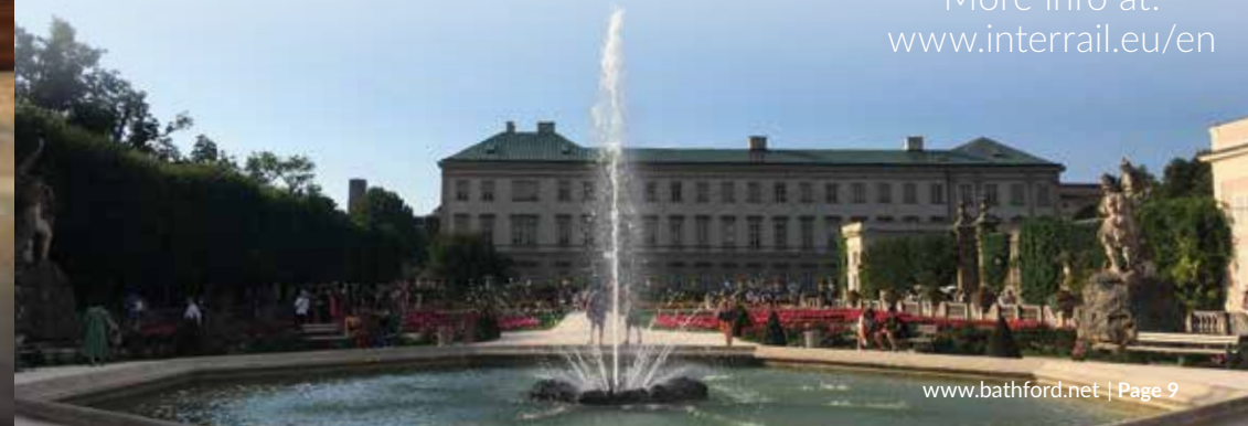
Photographs of Salzburg