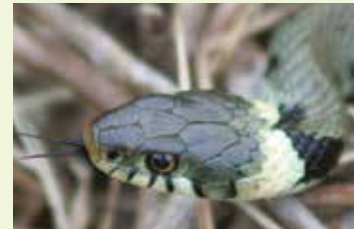
Grass Snake

glysohate is rendered harmless when it hits bare soil, if it gets into water, it simply spreads and will affect all pond life, and the one thing I'm really keen on is the wildlife in and around my pond. Now, here's a fact of life, wildlife needs food, just as we do. And wildlife feeds on . . . other wildlife. So, although I was mightily pleased to see a grass snake around the pond last year, taking it as a compliment to my gardening philosophy, I haven't seen frog spawn, dragonfly larvae, or newts since. I didn't know that grass snakes are such good swimmers. Damn it!