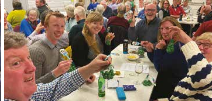
Happy with their winnings!