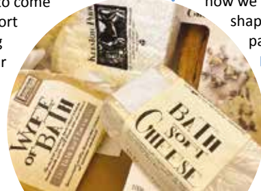
Some of the new selection of cheeses

As part of our ongoing efforts to expand our product range, we are delighted to introduce a selection of high-quality local cheeses, including Longman and The Bath Soft Cheese Company . We invite you to come and try them—your support helps us continue to bring great local products to our community. Let us know what you think!