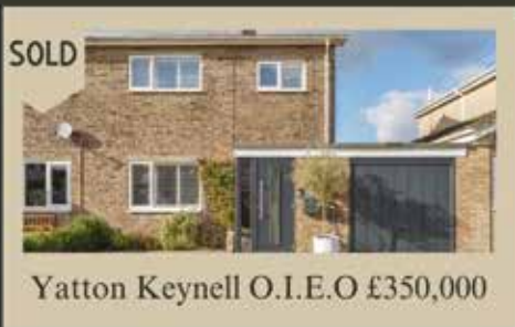
Yatton Keynell O.I.E.O £350,000