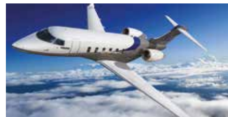
Bombardier Challenger 350

In 2007, he joined NetJets – the largest business jet company in the world. He now pilots a Bombardier Challenger 350, which has 3 crew (captain, co-pilot and flight attendant) and seats for nine passengers, flying all over Europe, Africa, the Middle East, and occasional trips across the Atlantic.