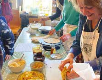
Fabulous food preparation