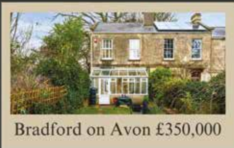
Bradford on Avon £350,000