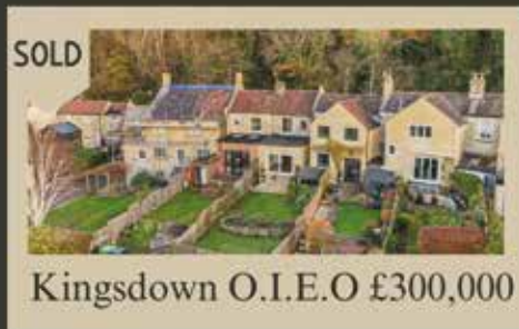
Kingsdown O.I.E.O £300,000

20 Wellsway Bear Flat 246 High street Batheaston