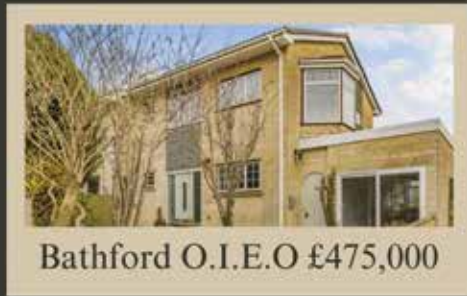
Bathford O.I.E.O £475,000