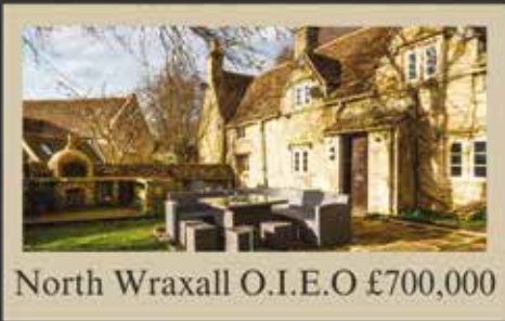
North Wraxall O.I.E.O £700,000