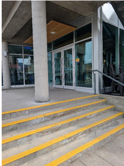
CAWSTON AVENUE ENTRANCE