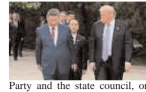
Party and the state council, or China's cabinet. It is adjacent to the capital's famed landmark of the Forbidden City and just off Tiananmen Square.

The garden now houses the offices of the ruling Communist