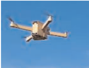
The secretary said the army was moving aggressively to integrate autonomous systems,

Future battlefields would be dominated by scalable unmanned technologies. US Army secretary Daniel Driscoll said the character of the war was changing at unusual speed and at unprecedented speed.