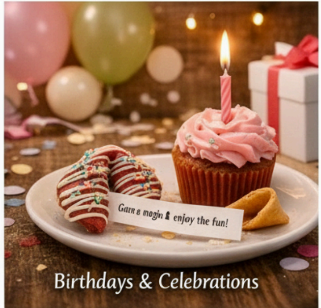
Birthdays & Celebrations