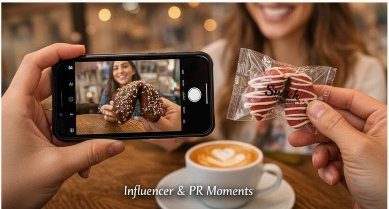
Influencer & PR Moments