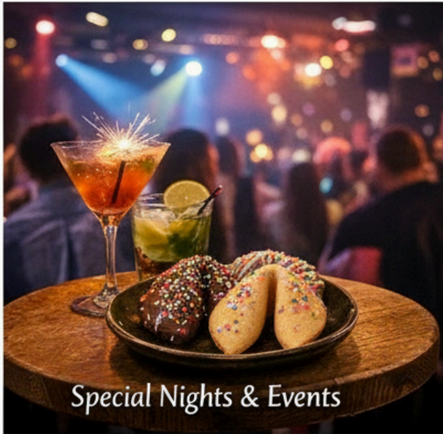
Special Nights & Events