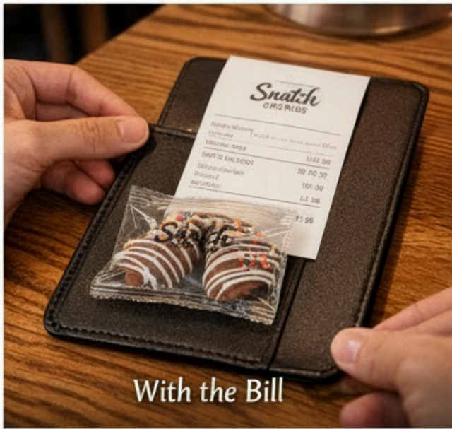
With the Bill