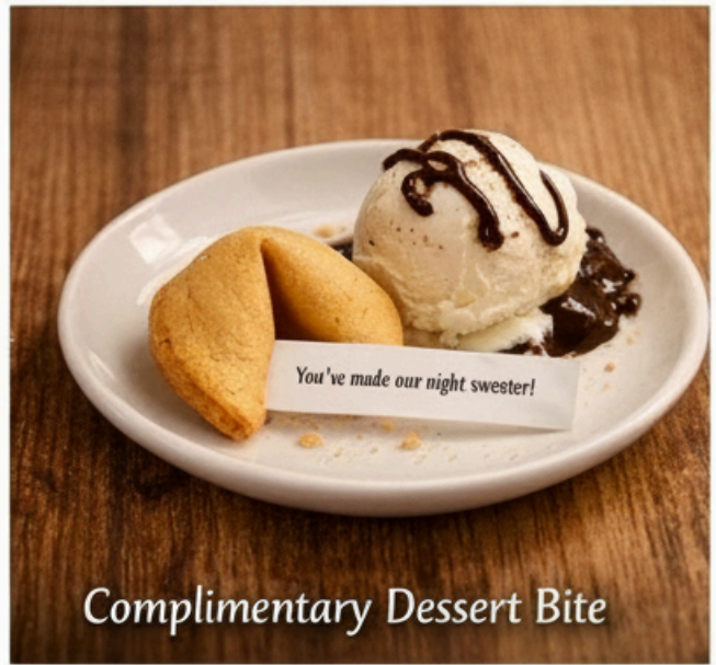
Complimentary Dessert Bite