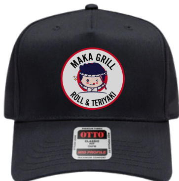
CAPS & HATS

Custom accessories that help extend your brand beyond apparel.