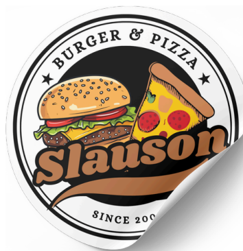
STICKERS & LABELS