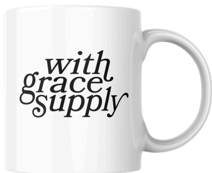
MUGS & DRINKWARE