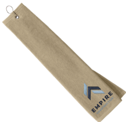
TOWELS & GOLF TOWELS