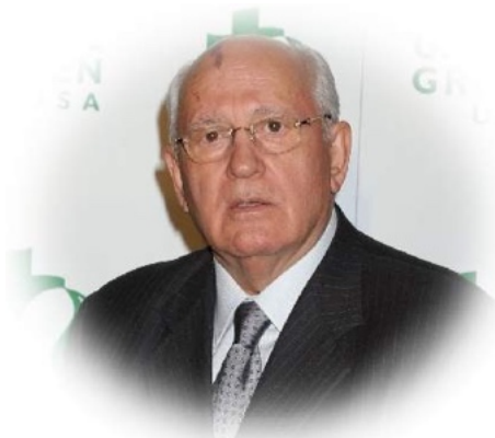
Mikhail S. Gorbachev Founder President of GCI