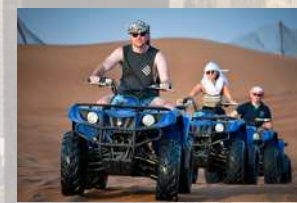
ATV Ride (Own Cost)