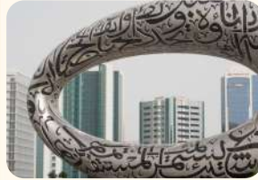
Museum of Future