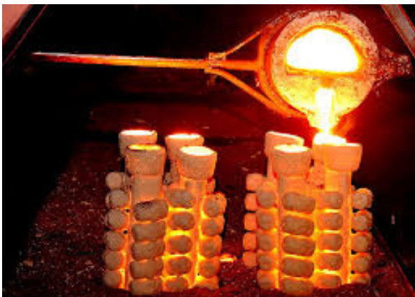
Aluminium Investment Casting