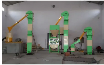
2) Cattel feed plant