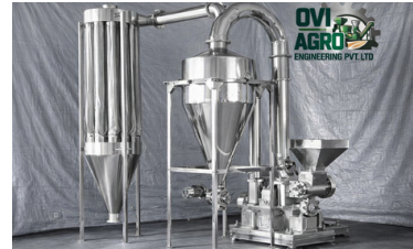
6) Besan Making plant