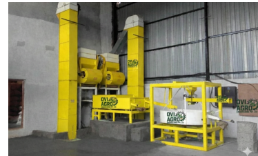
12) Penutshelling plant