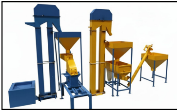
1) Makka Bharda plant