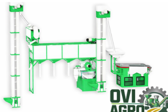
8) Cleaning and grading plant