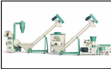
4) Poultry feed plant