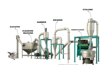
9) Masale Making Plant