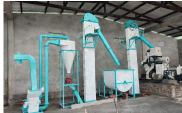
5) Fish feed plant