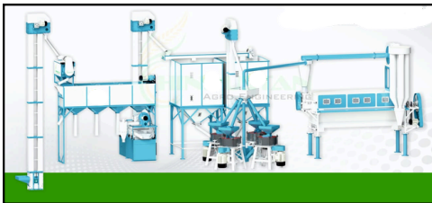
7) Flour mill plant