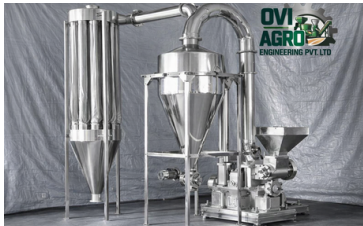
10) Turmeric Processing Plant