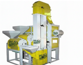
11) Dall mill Plant