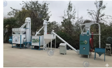
3) Maize Grit plant