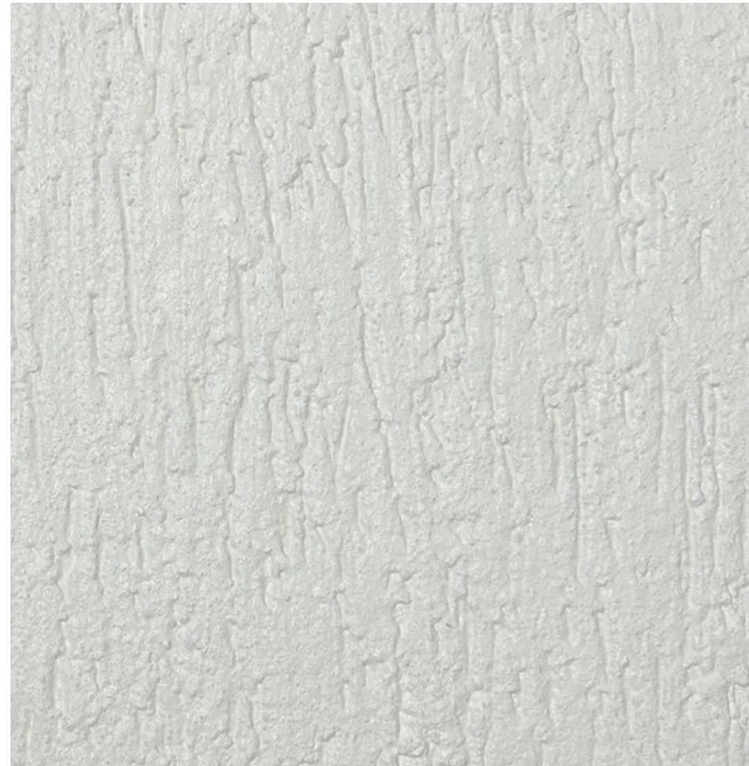
Finishing with Trowel