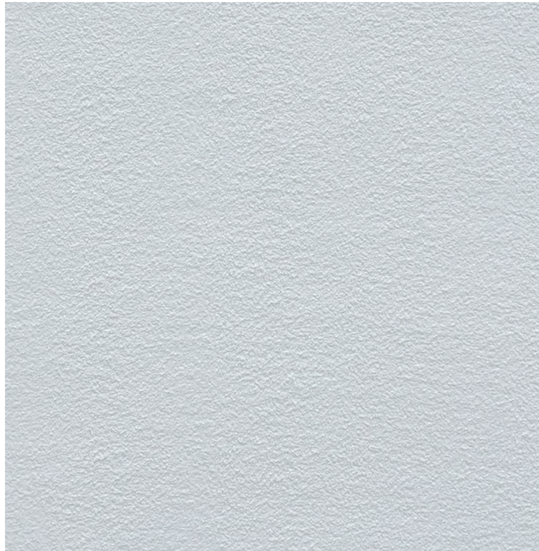
Finishing with Roller