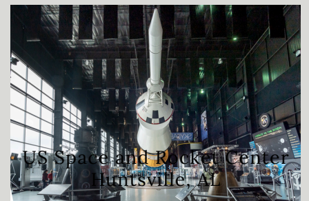
U.S. Space and Rocket Center Huntsville, AL