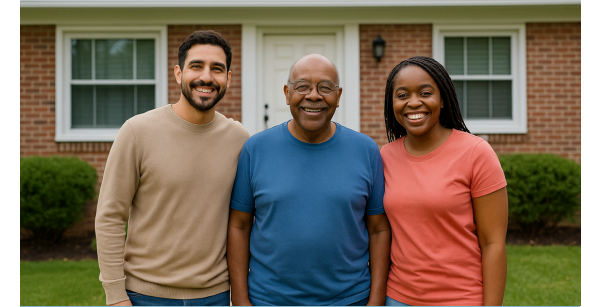
Residential Support Services