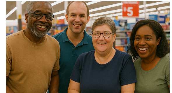
Day Support Program