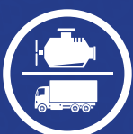
HEAVY DUTY DIESEL ENGINE OILS