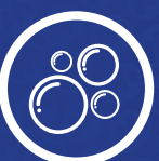
HYGIENE & CLEANING

Morris Lubricants provide a wide-range of products to cover a multitude of applications. If you have a specific product requirement that is not covered in this brochure, please call a member of our sales team on 01743 232 200, or email info@morris-lubricants.co.uk .