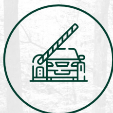
GATED TOWNSHIP WITH 24X7 SECURITY