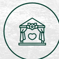
MULTIPURPOSE PARTY HALL