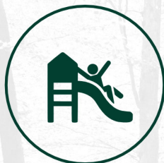
KIDS PLAY ZONE