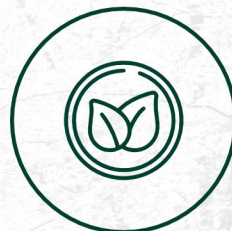
POLLUTION FREE ENVIRONMENT