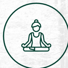
GREEN PARK FOR YOGA AND MEDITATION