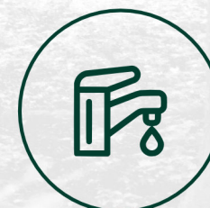
24X7 WATER SUPPLY