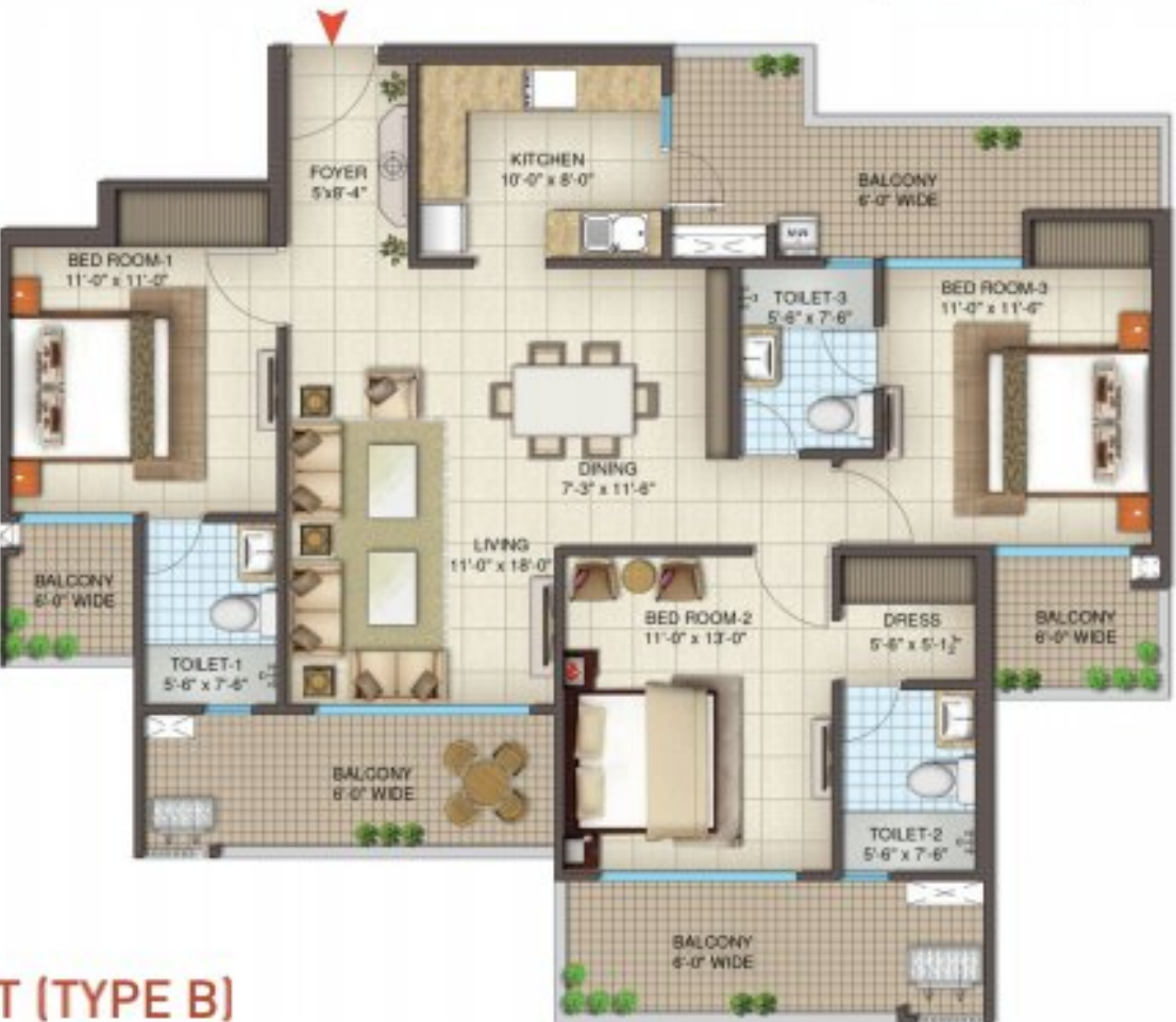
3 BHK+3 TOILET (TYPE B)

Super Built-up Area - 2050 Sq. Ft. (Approx.)