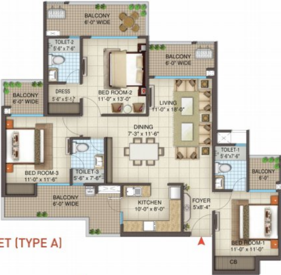
3 BHK + 3 TOILET (TYPE A)