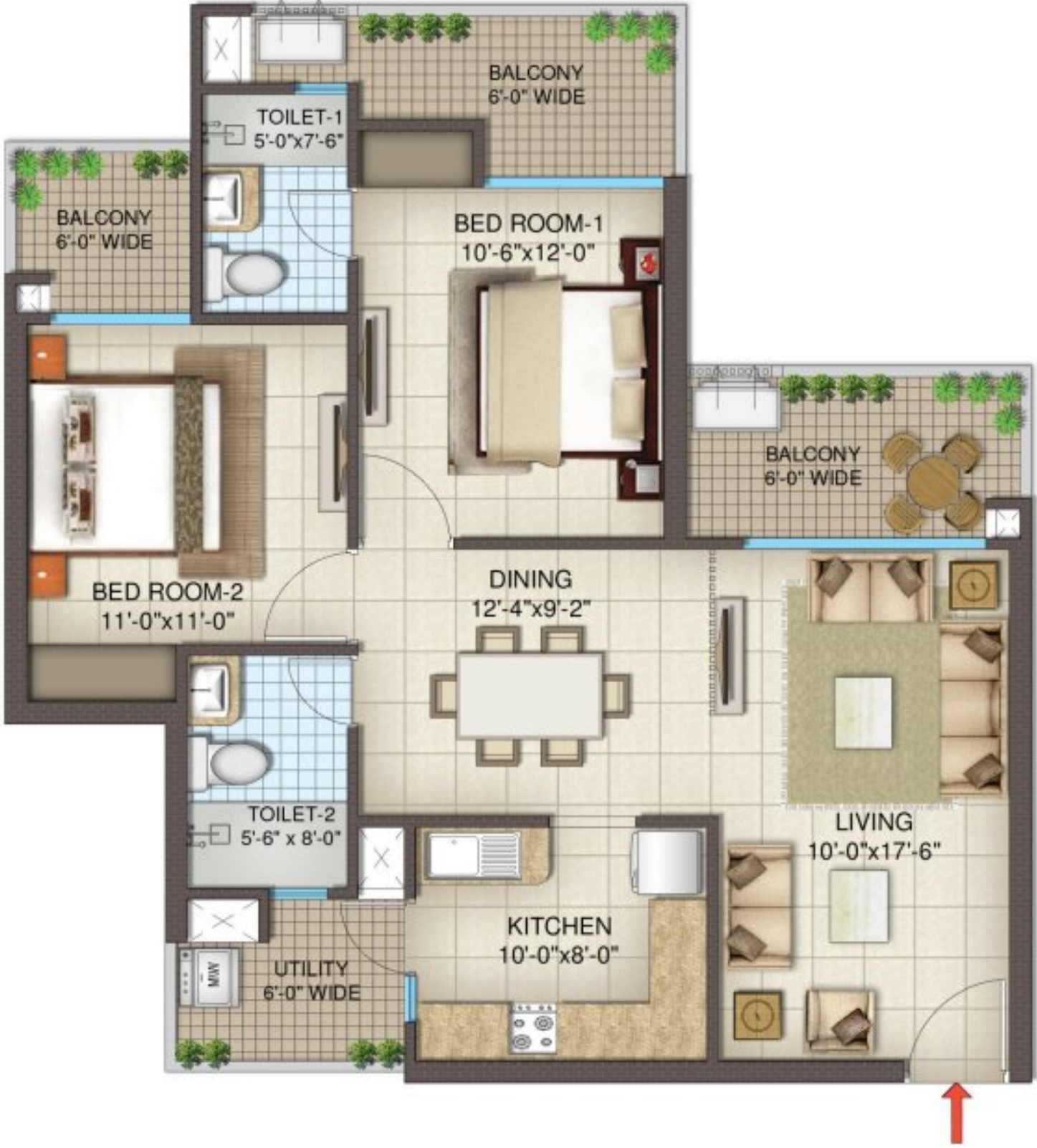
Super Built-up Area - 1325 Sq. Ft. (Approx.)