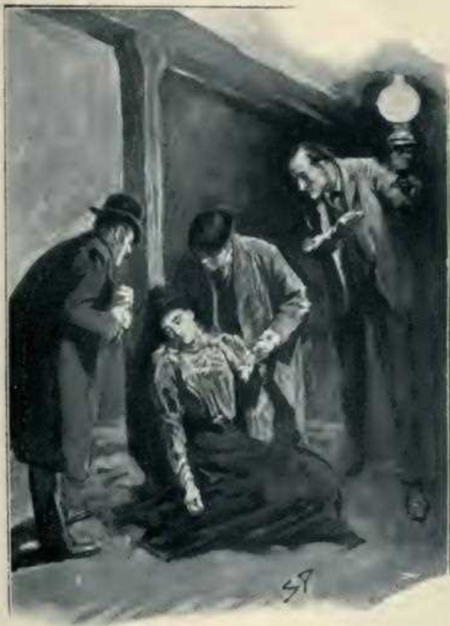
"MRS. STAPLETON SANK UPON THE FLOOR," P. 347.