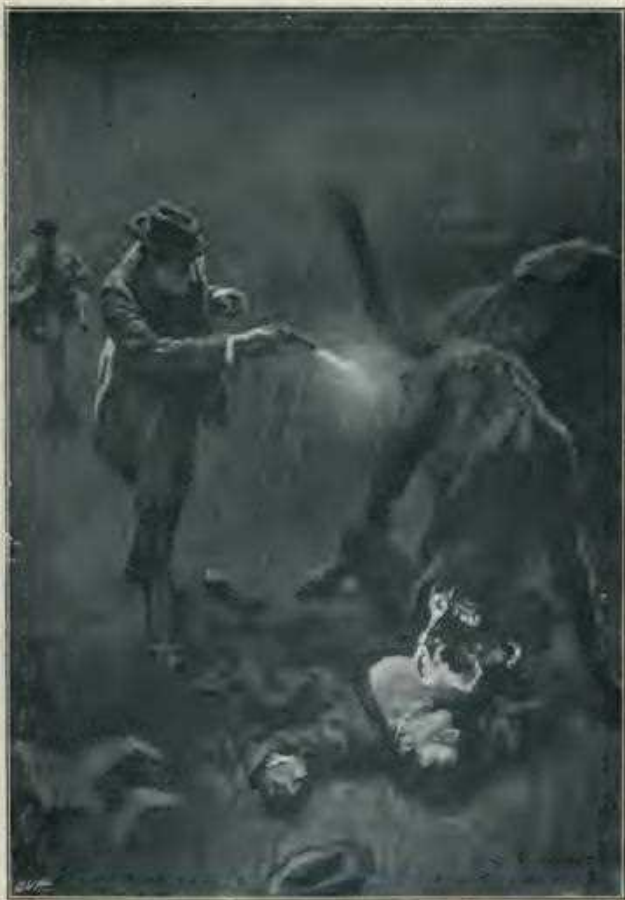
p. 322. "HOLMES EMPTIED FIVE BARRELS OF HIS REVOLVER INTO THE CREATURE'S SIDE."