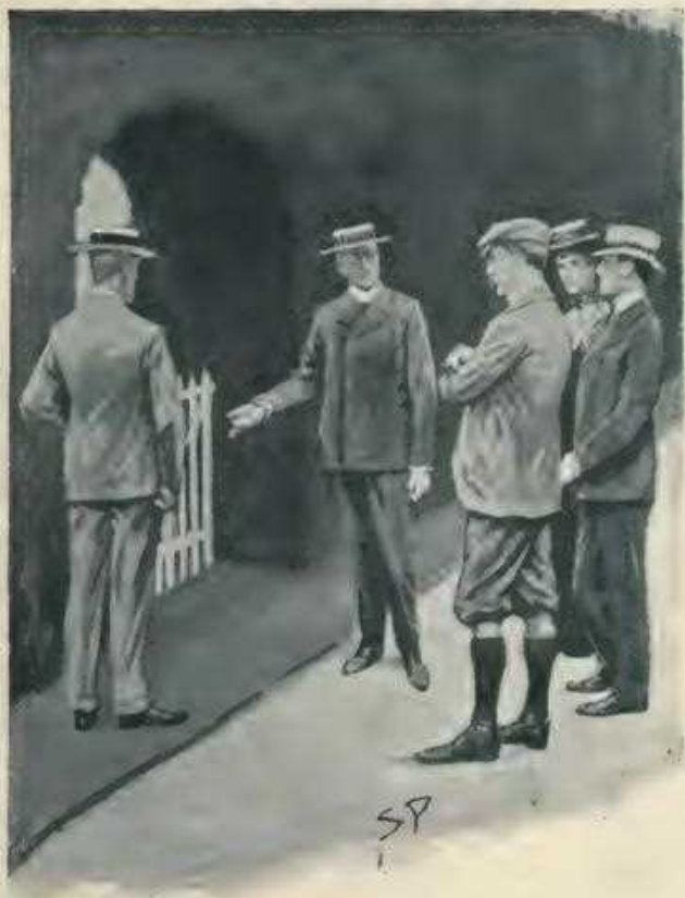
"THE YEW ALLEY."