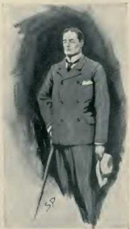
SIR HENRY BASKERVILLE.