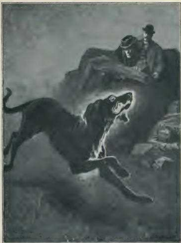
"THE HOUND OF THE BASKERVILLES."