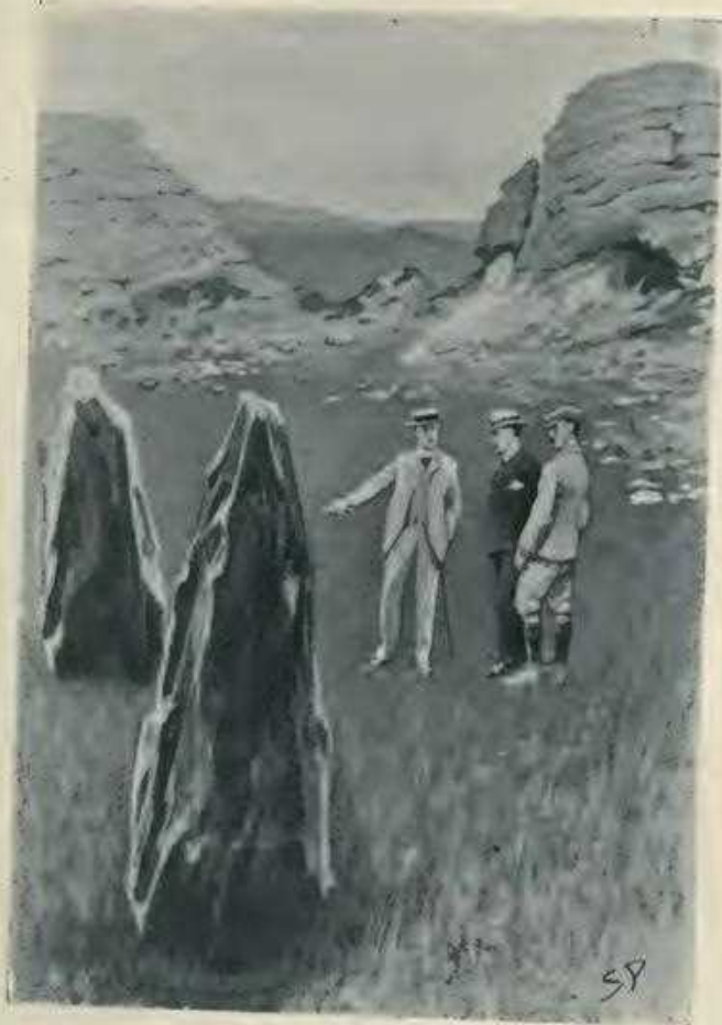
"HE TOOK US TO SHOW US THE SPOT."