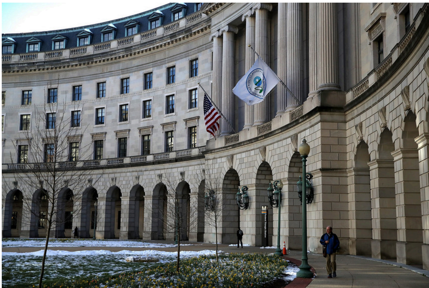
EPA headquarters in Washington.

BY: ELLIE BORST | 04/13/2026 03:55 PM EDT