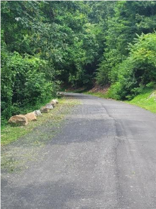
Grants Mnt Rd View from Pisgah Dr.