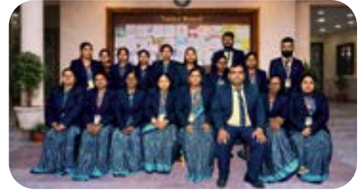
D.A.V. SHIKSHA DEEP ,RATU ROAD BRANCH

At DAV Shiksha Deep School, our teachers are the backbone of our academic excellence. With strong subject expertise and a passion for teaching, they create a nurturing and disciplined learning environment that inspires students to achieve their full potential.