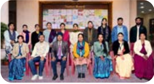
D.A.V. SHIKSHA DEEP ,KAMRE BRANCH