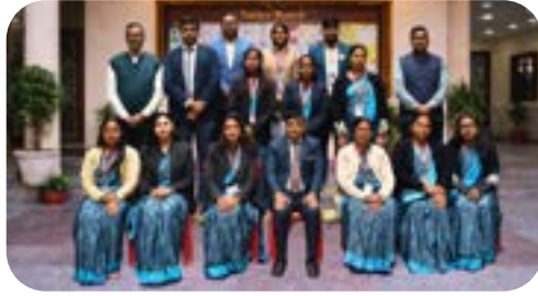
D.A.V. SHIKSHA DEEP ,HEHAL BRANCH