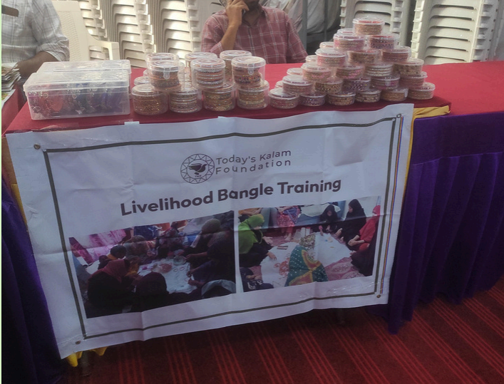
OUR STALL IN HSSR FAIR AT NAMPALLY

Kalam Foundation associates attended the HSSR Fair at Nampally and the Bharatiya Sanskriti Utsav at Sedam, Gulbarga, where they set up stalls showcasing bangle-making activities. The stalls highlighted traditional craftsmanship, promoting local artisans and providing visitors with a hands-on experience of the art, while celebrating cultural heritage.