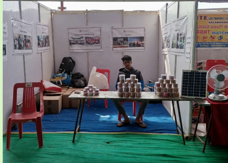
OUR STALL IN BHARATIYA SANSKRITI UTSAV AT SEDAM, GULBARGA