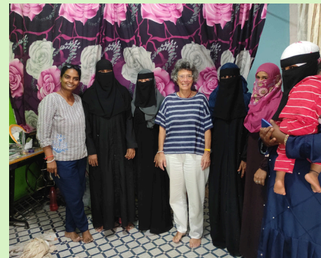
Delegation of 2 people from Italy visited our bangle making project.