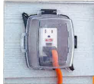
These are Sample Types Only-Attach your Projects' specific details

Exterior Electricity projects must be installed by a licensed electrician.