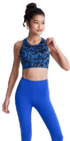
Sports bra with back clasp 24SS-B-064