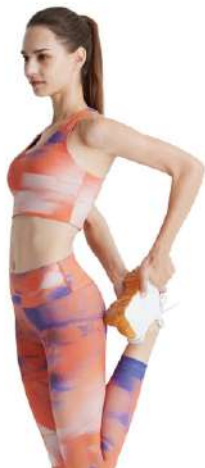
Sports bra with cup 24SS-B-024