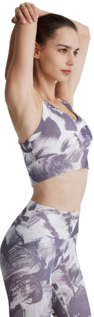
Sports bra with cup 24SS-B-032