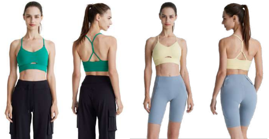
Sports bra with cup 24SS-B-001