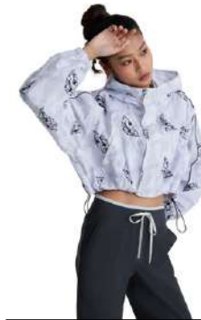
Sun Protection Clothing 24SS-C-034 1 Colour