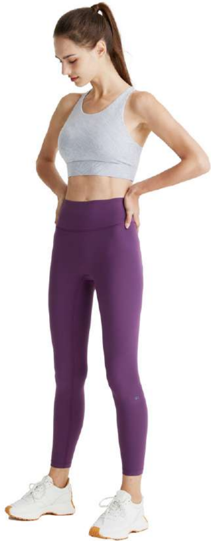
Jacquard Fabric Sport bra 24SS-B-057