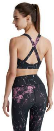
Sports bra with cup 24SS-B-013