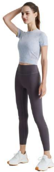
Jacquard Fabric T-shirt 24SS-T-060