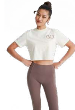
Short T-shirt 24SS-T-058 2 Colours