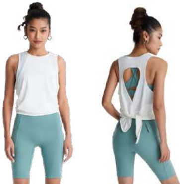
Quick-drying vest 24SS-T-031 4 Colours