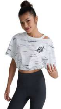
T-shirt 24SS-T-035 1 Colours

The fabric feels soft and slightly velvety, offering a comfortable touch. It incorporates Lycra (a type of spandex) for comfortable stretch without restriction, and is resistant to deformation. With a slim-fit design, it promotes perspiration and keeps you cool, hugging the body without being tight. It is suitable for daily wear, jogging, cycling, outdoor hiking, and other activities.