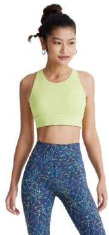
Sports bra with back clasp 24SS-B-050