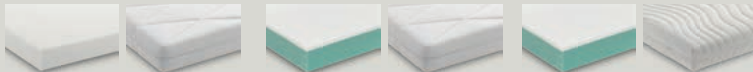
Iris in Acqua Foam