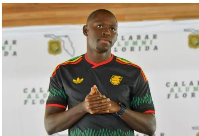
World 100m Champion Oblique Seville